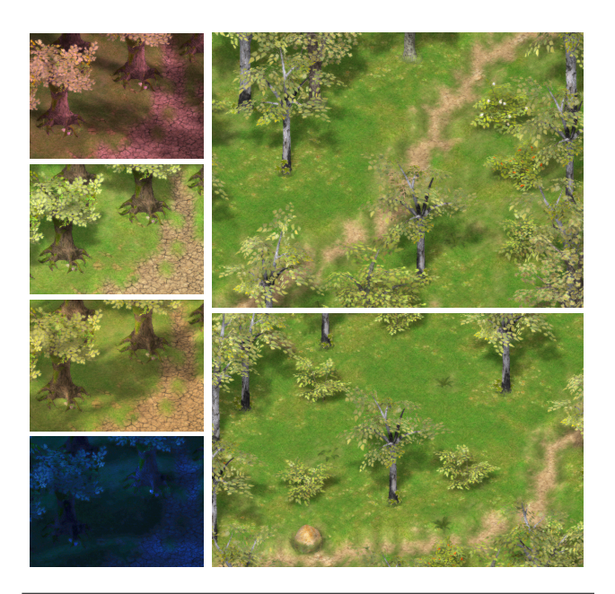
Figure 3. Reactive game engine screenshots

Reactive programming is a programming paradigm focused around propagation of values and the flow of data. Functional reactive programming aims to express reactive dependencies declaratively, and was established by the work of Elliott and Hudak on Fran [2]. Elm [1], Rx [5] and other FRP frameworks have no concept of containers.