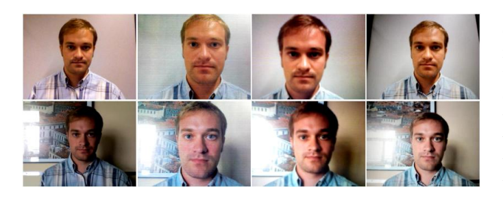
Fig. 1. Examples of real accesses and attacks in different scenarios. In the top row, samples from controlled scenario. In the bottom row, samples from adverse scenario. Columns from left to right show examples of real access, printed photograph, mobile phone and tablet attacks.

(1) hand-based attacks (the operator holds the attack media or device using their own hands); and (2) fixed-support attacks (the operator sets the attack device on a fixed support so they do not move during the spoof attempt). The first set of (hand-based) attacks show a shaking behavior which can sometimes trick eye-blinking detectors [8]. Figure 1 shows some frames of the captured spoofing attempts.