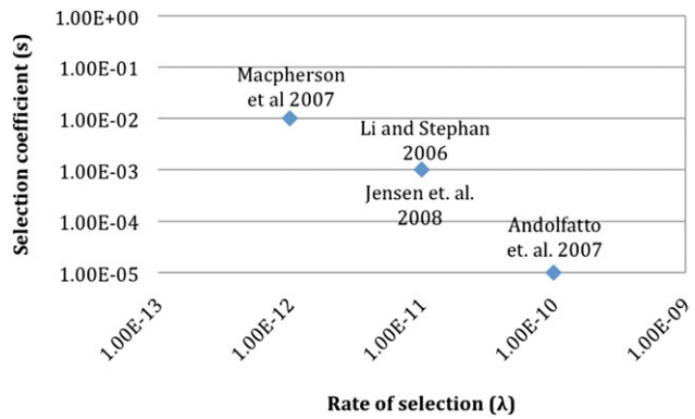
Figure 1. Relationship between the strength and rate of selection in Drosophila . The estimated values for the strength and rate of selection for various Drosophila data sets (see text). As shown, inferred values differ by orders of magnitude for both the rate and strength of RHH. There is perfect overlap between the estimates of Li and Stephan (2006) and Jensen et al., and they appear as one point on the graph.

A beneficial mutation that rises in frequency within a population due to positive selection will impact local variation by 1) increasing the frequency of linked neutral alleles—a process known as the hitchhiking effect (Maynard Smith and Haigh 1974; Kaplan et al. 1989), 2) increasing LD on either side of the target (Kim and Nielsen 2004), and 3) reducing local variation—with the extent of this reduction determined by the ratio of the selection coefficient and the local recombination rate ( s/r ). This distinct genomic pattern is known as a selective sweep and different statistical methods, which will be discussed below, have been developed to detect these characteristic patterns.