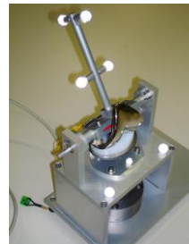
Figure 2: Mechanical simulator and instrumented knee prosthesis (F.I.R.S.T) equipped with reflective marker.

Mechanical knee simulators: The instrumented prosthesis where used in a mechanical system which simulates 3D rotational movements of the knee. Optical motion capture (Vicon, UK) and reflective markers on known geometry of the simulator were used to track the exact kinematics of the prosthesis (Figure 2).