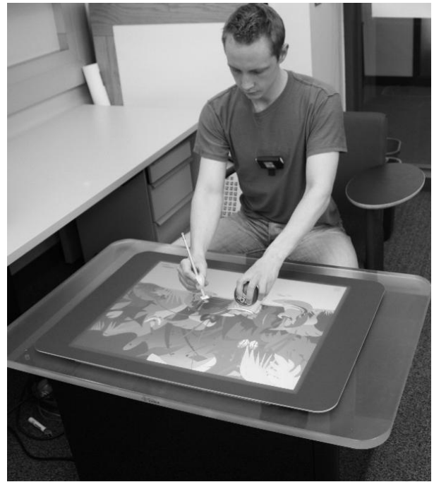
Fig. 1. The complete system in use. The user is wearing the accelerometer and using tangible inputs while playing the "Butterfly" game.

Using the Bluetooth protocol, the Surface platform is connected to a small accelerometer, attached to a custom-made vest worn by the patient. This is used to measure trunk rotation. The accelerometer data is sampled at 100 Hz and transmitted to the Surface, which processes the data and uses this feedback in the games. The metric used is trunk flexion, which indicates a patient leaning forward to compensate for limited range of movement in the elbow and/or shoulder. When a patient leans forward past a certain threshold, an event is triggered in the game. An onscreen indicator shows the patient's current body position in relation to this threshold, allowing for self-correction when this point is being approached. The threshold level for trunk rotation for each patient is different, and can be adjusted by the therapist so as to match each rehabilitation exercise to the patient's ability. In this way, the therapist can make the exercises more challenging as the patient's range of motion improves over time. The software was developed in C# and XAML, using the Microsoft Surface software development kit.