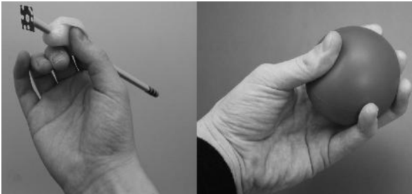
Fig. 2. Examples of the tangible interaction objects: a pencil modified with an optical tag and a customized grip on the left, and a foam ball used to counteract involuntary finger flexion on the right.

It was necessary to design the games so that they may be used by patients with a broad range of ability – in terms of both motor ability and cognitive function.