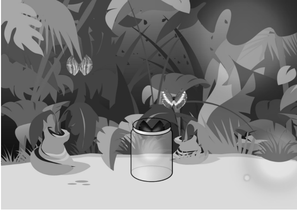
Fig. 4. A screenshot from “Catch the butterflies,” a game requiring bimanual interaction. Both of the tangibles shown in Fig. 2 are used, and both dominant and non-dominant hand must be coordinated in order to catch the butterflies in the jar.

the game parameters during the session to suit each patient, for example by changing the sensitivity of the accelerometer or the speed and location of the moving butterflies.