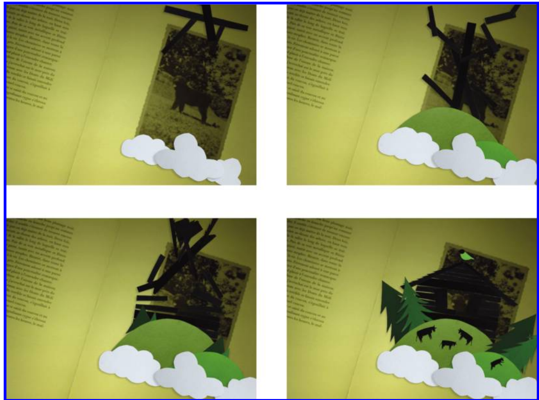
Figure 3. Successive snapshots of an animation. Falling wood planks build up a chalet, and the window opens to reveal the picture behind. © 2008 Camille Scherrer.

The core of our project is to generate interaction between two originally conflicting worlds in order to create a new source of creativity. Between paper and screen, we thought for awhile that the second medium would be the former's downfall, and we describe in this section how our work offers an original way to reconcile or confront both media. We first explain the concept on which our work is based, then describe the design and content we chose to illustrate it. We finally turn to the more technical aspects, to show how the technological part is integrated seamlessly into ordinary objects.