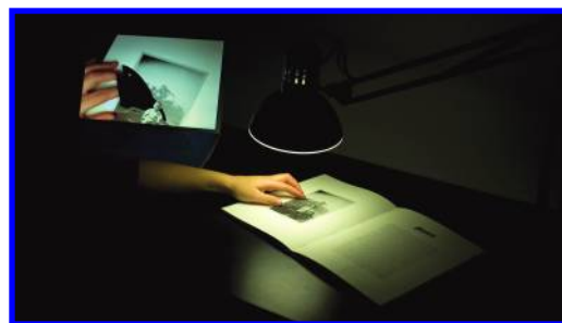
Figure 1. A book and a computer screen showing images taken by a camera hidden in a lamp. This setup offers a new language to bring the real and virtual worlds closer to each other, to weave new meanings between the visible and the invisible.

world. To further increase this confusion, nothing gives away the technology, although in this case it is quite sophisticated. For each of the book's pages, animated worlds miraculously appear and disappear, with a direct connection to the actual items printed on paper: animal figures appear over the mountains, peaks emerge in a shadow play, a bird silently flies over the scene, foxes light up the text with their lanterns at dusk (Figure 1). The computer screen acts as a revealer, offering viewers a reality quite different from the reality they perceive when they look directly at an object.