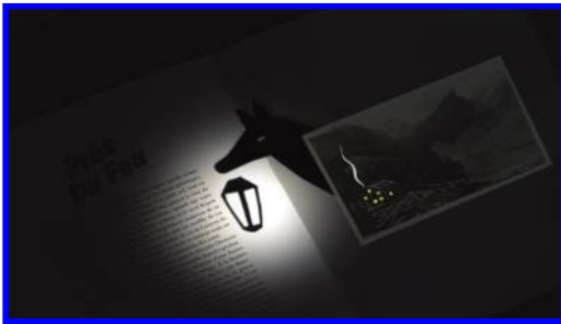
Figure 5. Another example of a revealed scene. The paper and the text are real, and the darkness effect, the fox, and the light are created by the computer. © 2008 Camille Scherrer.

of the camera in the lamp, our setup makes it possible to forget the usual technological constraints and provide a look of authenticity, which is one of the primary drives of this work of art.