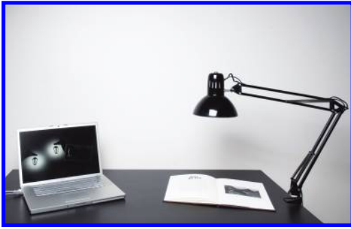
Figure 4. Our setup. The lamp acts as a normal lamp, but also hides a webcam. A standard computer processes the images captured by the webcam and adds the virtual elements. The created images are displayed on the computer screen.