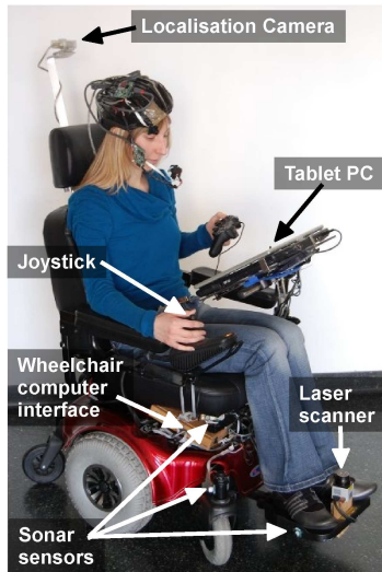
Fig. 1. Global localisation data from the camera is used alongside dynamic sensory data from the laser scanner and sonars to assist the user in performing precise manoeuvres [12].

incapable of manoeuvring safely themselves [11]. We follow this recommendation for our robotic wheelchair (Fig. 1), keeping the control user-initiated and only adapt signals where necessary, e.g. to prevent a collision or to perform a particularly precise manoeuvre [12].