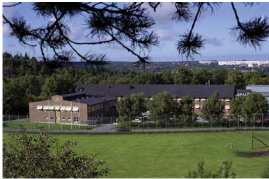
SIK – The Swedish Institute for Food and Biotechnology