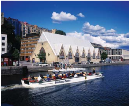
"Paddan" sight-seeing boat in Gothenburg

Chalmers University of Technology, Gothenburg, Sweden April 7-8, 2010