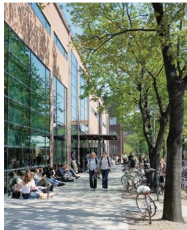
Chalmers University of Technology