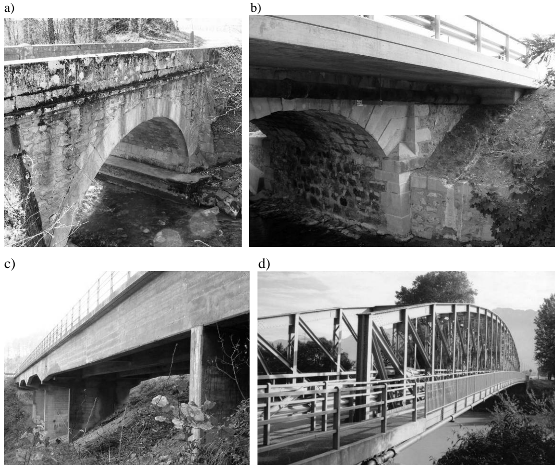
Figure 1. a) Masonry bridge, b) Masonry–concrete bridge, c) reinforced concrete bridge, d) steel bridge.

The bridge stock of the road network of a Canton (region) in Switzerland is investigated. This canton has a 2'126 km long road network comprising 667 bridges. This bridge stock can be subdivided into four major groups depending on the construction type and construction material as follows (Table 1):