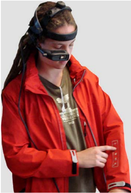
Fig. 2. User interacting with the i-jacket

500 monocular see-through head-mounted display (HMD) and an ultra-mobile PC (UMPC, Sony Vaio UX70) as shown in Fig. 2. The decision of using MR instead of augmented-reality (AR) has been motivated by the relatively poor results yet achieved in the field of mobile indoor tracking. Indeed, techniques like pedestrian dead reckoning (PDR) [2] or Bayesian localization framework using WiFi signals [6] does not give satisfying enough results to ensure the registration process needed for convincing AR.