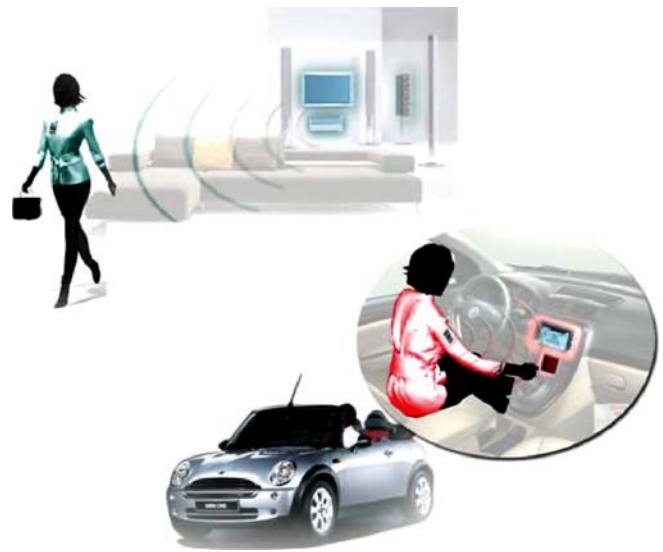
Fig. 1. Visionary scenario

Chloe prepares herself to go out while listening to her preferred music. She transmits orally her program of the day as well as her itinerary to her electronic agenda, which is somewhere in the house. At the time of leaving, she puts on her INTERMEDIA jacket. At this moment, all the data of each multimedia device are transmitted automatically to her jacket (e.g., the itinerary which she intends to follow this morning and her music selection, see Fig. 1). Chloe gets into her car. The information contained in the jacket is transferred to the electronic device in the car: the car radio