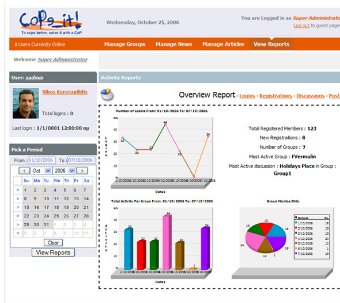
Figure 2: Overview statistical report