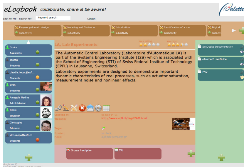
Figure 1: Embedded awareness cues in the Context-Sensitive View. Focal Element: Activity