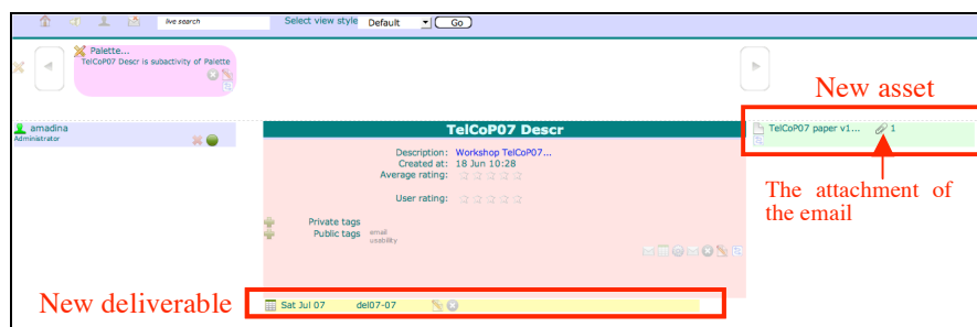
Fig. 9. Context view of the activity “TelCoP07”. A new deliverable is created.