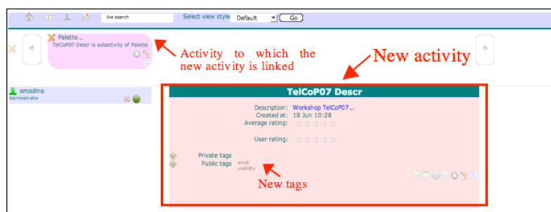
Fig. 6. Context view for the new activity “TelCoP07”.