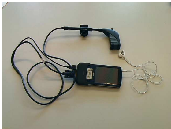
Figure 2: Our lightweight platform: Toshiba e800 PDA, Liteye-500, headphones.

In this section we present our wearable Mixed Reality framework: firstly, we show a conceptual overview of the entire system architecture; secondly, we deepen into more technical details about every aspect of our platform.