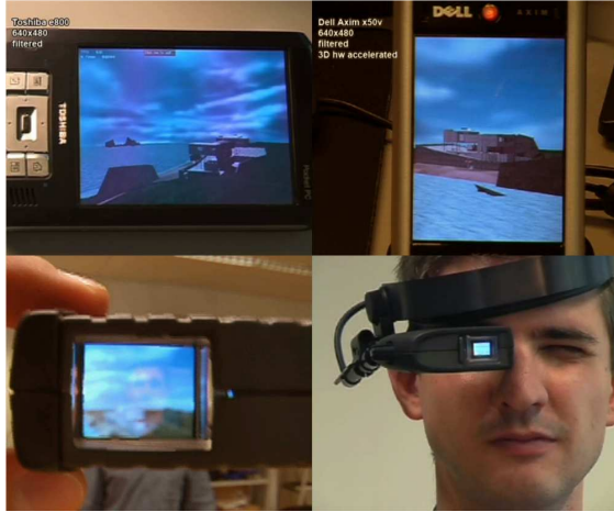
Figure 3: Test scene rendered in realtime on the e800 and x50v embedded screen and on the head-worn display.

frustrating drawback: enabling an external display disables onboard graphic hardware acceleration, so we had to use the software-mode OpenGL ES implementation in this case, too, thus degrading performances. Moreover, OpenGL ES specifications do not allow to directly access the draw-buffer: we had to call the slow glReadPixels function once per frame, in order to get a copy of the rendered image. glReadPixels under OpenGL ES allows only to retrieve images in 32 bit RGBA format, wasting unnecessary resources and requiring a second conversion to a 16 bit format working with the VGA external adapter. Finally, Liteye-500 accepted only 800x600-sized streams, requiring an additional bitmap scale. We extremely optimized the code we used for this purpose: nevertheless, the biggest bottleneck was the glReadPixels which is unavoidable. All these limitations halved our framerate when connected to the see-through head-mounted display.