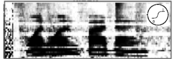
Soft Mask : each value assigned weight in [0,1]