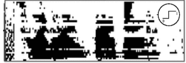
Hard Mask : each value present or missing