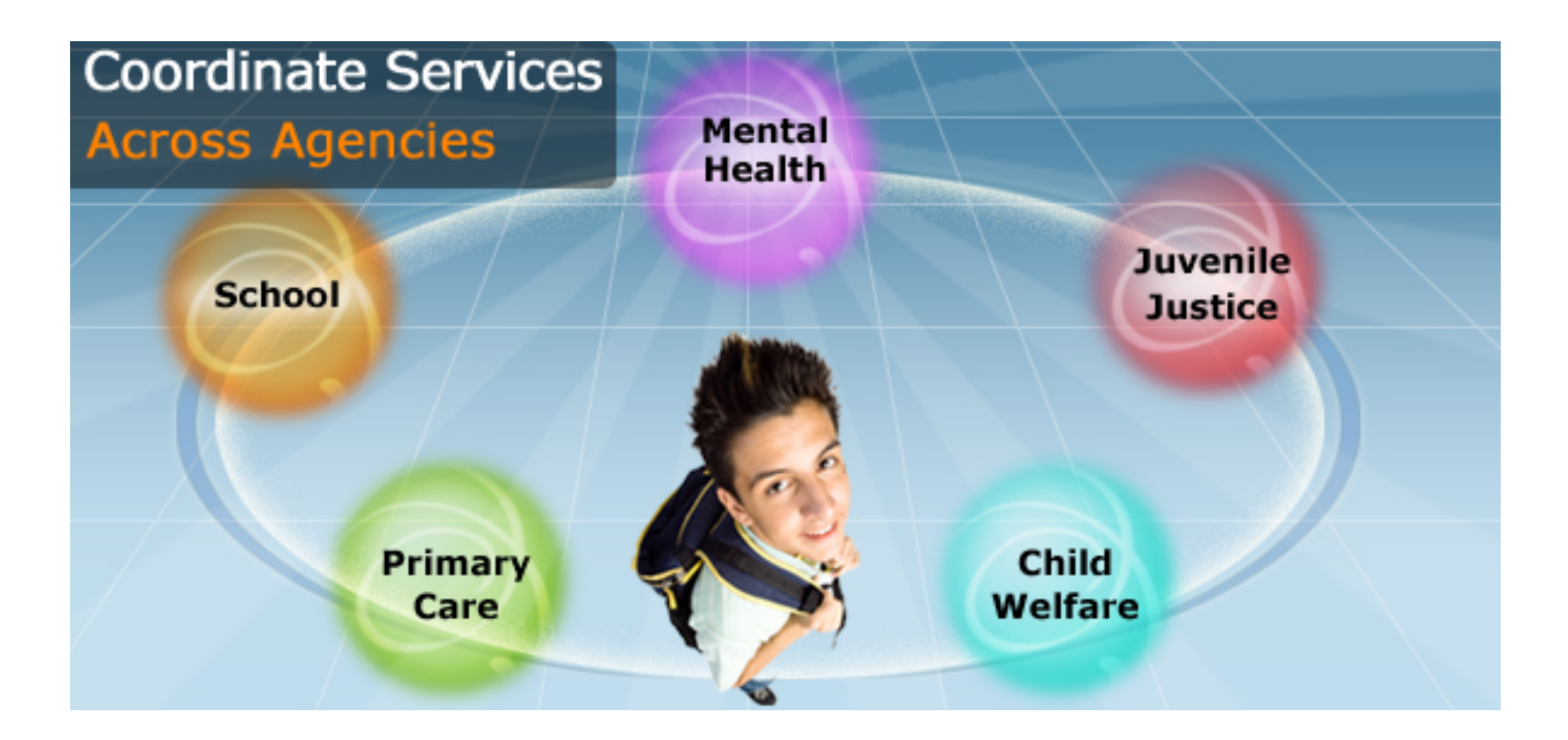
Figure 2. Graphical depiction of coordinating agencies.

The implications for positive social change include the potential to identify day-to-day behavior that may be able to predict performance. These potential relationships can aid child services facilities in identifying appropriate intervention strategies aimed toward reversing negative performance outcomes; getting the child back to a more preferred functional state. There is an potential for Health and Human Services policy-makers to better allocate limited resources aimed toward effective and efficient treatment. Coordinating agencies (figure 2) stand to benefit from this knowledge as there is a potential to understand the relationship between adolescent behavior and performance.