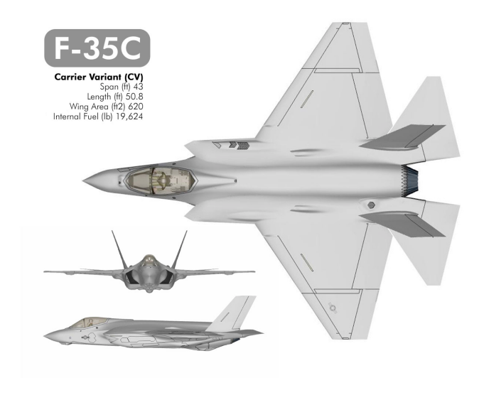
Figure 3. F-35C carrier variant (CV). From "F-35 Variants," by F-35 Lightning II Program, n.d., retrieved from http://www.jsf.mil/f35/f35_variants.htm

The Navy will replace its F/A 18 E/F Super Hornet with the F-35C variant fighter, which will have CV capabilities. The CV variant is intended to withstand severe sea and carrier conditions. This fighter will have the advantage to obtain the same capabilities as the other variants, yet, serve as a maritime fighter. The F-35C variant is distinctive because it is one of the upgraded fighter jets that can be operational at sea. According to Lockheed Martin, there has never been a low observable aircraft that functions the same operations as the air to ground and air-to-air jets at sea (2014, CV section, para. 1). Additionally, it has a broader wingspan than the other variants with "ruggedized structures and durable coatings and is designed to stand up to harsh shipboard conditions while delivering a lethal combination of fifth generation fighter capabilities" (LM, 2014, CV section, para. 1). The F-35C also has upgraded weapons systems like the A and B variants as well as special modernized features that can really withstand potential air and