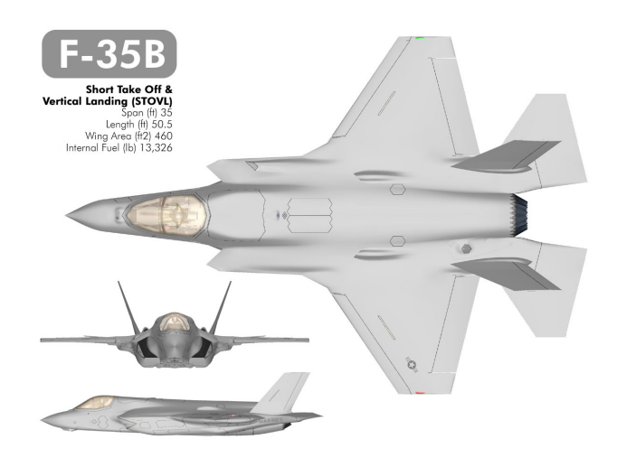
Figure 2. F-35B short takeoff & vertical landing (STOVL). From "F-35 Variants," by F-35 Lightning II Program, n.d., retrieved from http://www.jsf.mil/f35/f35_variants.htm

The F-35B model will replace the Marine Corps' F/A 18 C/D Hornet and AV-8B Harrier aircraft. The Marine Corps' F-35B variant has STOVL capabilities in which the fighters can takeoff on a short runway or carrier. Additionally, the STOVL variant gives the fighter the ability to takeoff vertically, dependent upon the weight capacity and payloads. This feature would be necessary when the fighter is not landing on a runway. Furthermore, the F-35B will "revolutionize expeditionary combat power in all threat environments by allowing operations from major bases, damaged airstrips, remote locations, and a wide range of air-capable ships" (LM, 2014, STOVL section, para. 2).