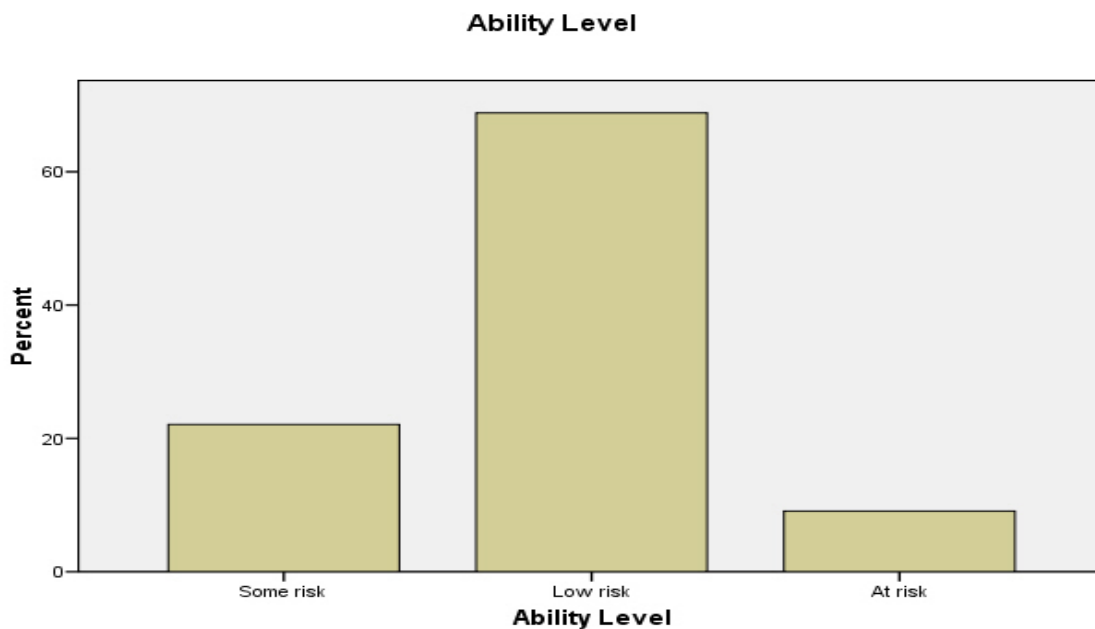
Figure 1. Study ability level distribution.

Table 1 shows there were 53 (69%) low risk study participants, 17 (22%) some risk study