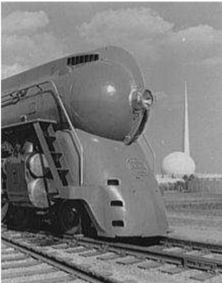
“Democracy”, diorama, detail (1939) Lubbner Jet-plane behind

much of it is retained: the Airstream Futuropolis is here, in that • Speed increaseth aerodynamism thus was a good bet, though trains not the carrier