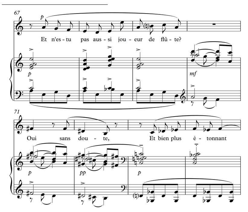
Example 1: Satie, Socrate , movement I, Le Banquet , mm. 67–74 (from Vocal Score [VS], p. 6).

ornament. Example 1, taken from the first movement of Socrate , is typical of Satie's setting. The vocal line mostly moves stepwise, with occasional leaps (mostly octaves, fifths, and fourths). The accompaniment is cellular, comprised of simple repeating figures.