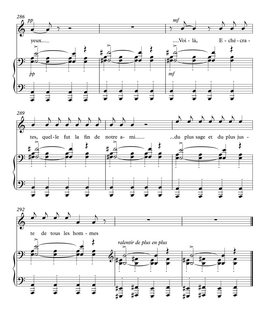
Example 5: Satie, Socrate , movement III, La Mort de Socrate , mm. 286–94 (VS, p. 71).

and final movement of the work), Phaedo remains the anonymous narrator speaking in the past tense; the libretto effaces the dialogic aspects of the original text, and Phaedo's dialogue is turned into a narrative. But in the final lines, Satie abruptly shifts back into a mimetic mode: