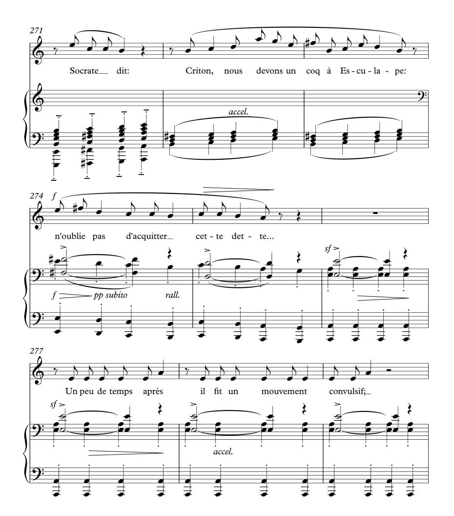
Example 4: Satie, Socrate, movement III, La Mort de Socrate, mm. 271–79 (VS, pp. 69–70).

and every sort of ecstasy and riot. If even Apollo can be maddened by a music contest, it suggests how dangerous is the goal of expression in the arts: the expresser may find himself most horribly exhibited, ex-pressed, pressed out" (Albright 2000, 18). If Apollonian music can invoke the barbarity of the god who skinned Marsyas, how do we reread "stripped-down" neoclassical narratives to account for such shifting meaning?