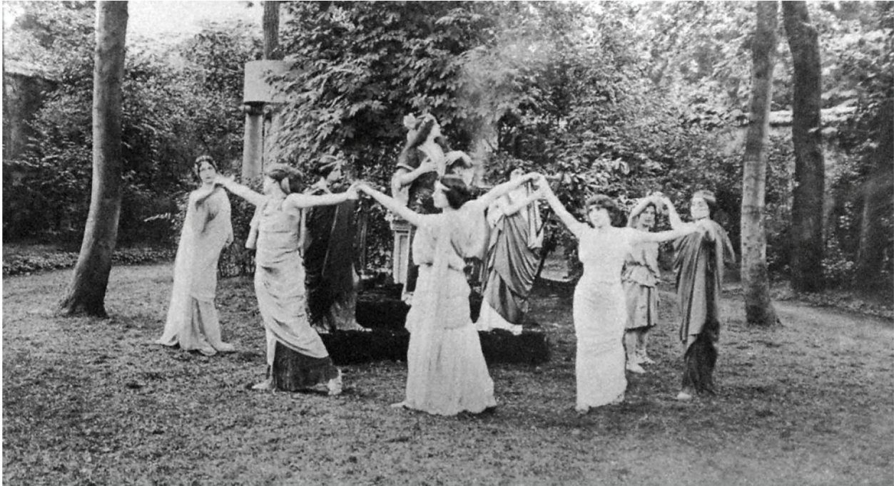
12. A gathering of women including Eva Palmer, Natalie Barney and possible Liane de Pougy in Barney's garden in Neuilly.