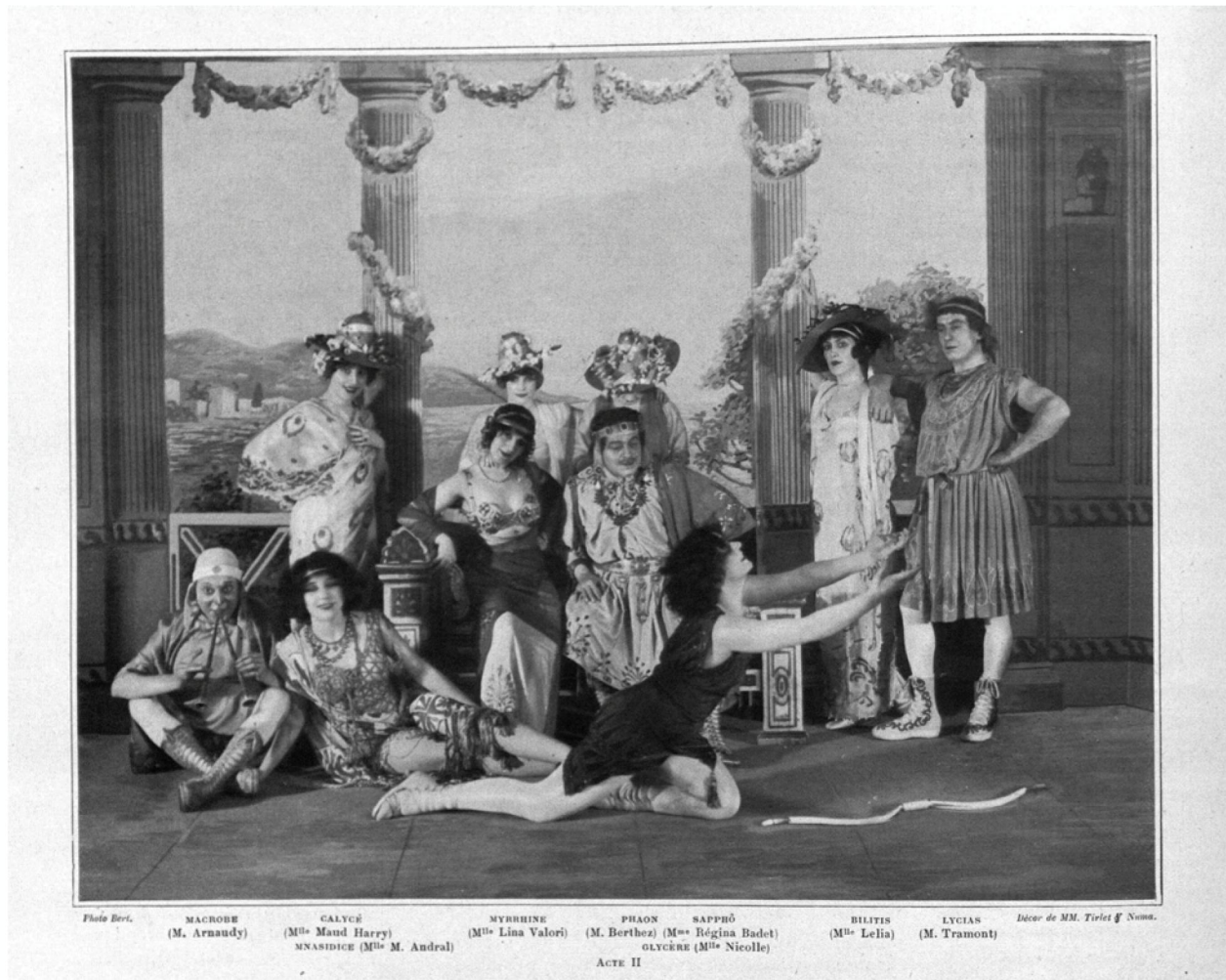
10. Production photo from act II of Sappho by André Barde and Michel Carré. Le Théâtre 319 (1 April 1912), 22.

Her garden centered on an elaborate Greek-style Temple of Friendship , prominently housing a bust of Sappho [fig. 11], where Paris's most elite lesbians gathered to see and to be seen. Dressed in elaborate costumes as ladies and pageboys, or maybe, like the writer Colette, sliding through the garden stark naked, visitors to Barney's home enjoyed a place where many women could express their sexuality freely without fear of persecution or judgment, amidst a bouquet of exotic incense and under the watchful gaze of Sappho's statue.