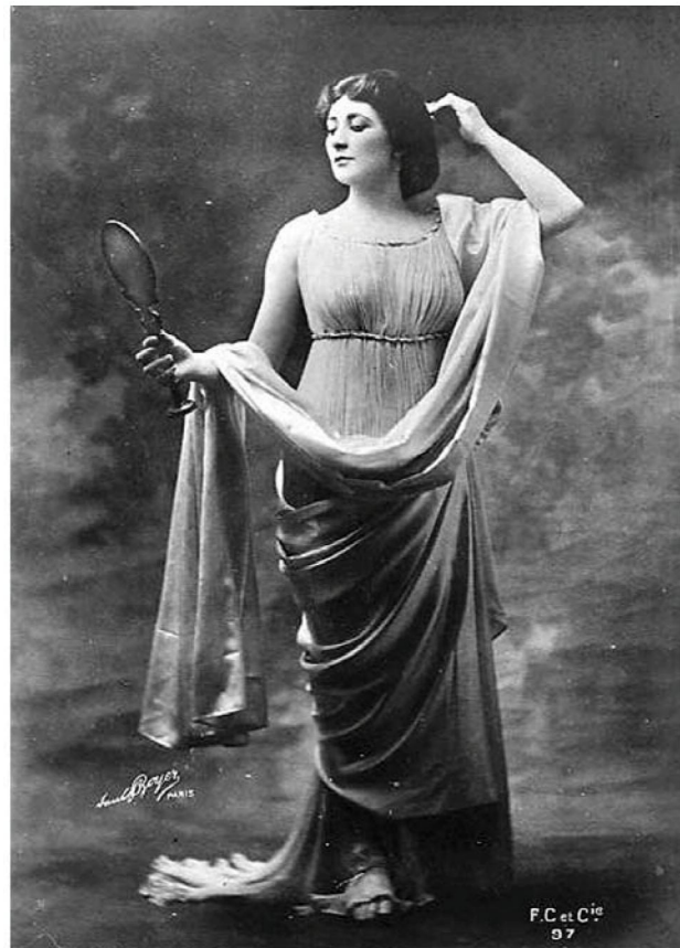
GARDEN de l'Opéra Comique