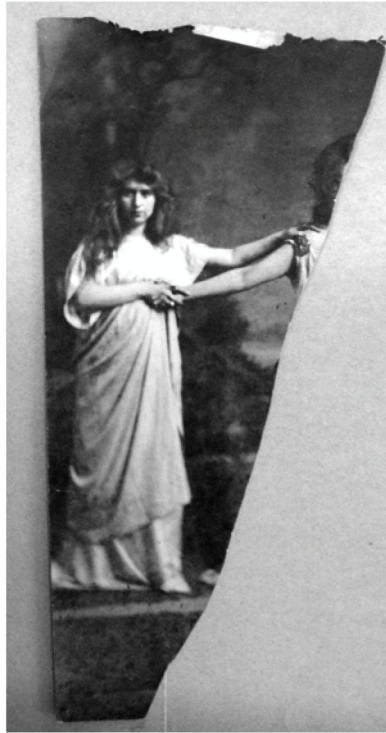
15. Natalie Barney. Washington, D.C., Smithsonian Institute Archives, Alice Pike Barney Papers Acc. 96-153, folder 6.75.

That very day, Natalie had an antique flute delivered to Renée. Renée answered by a telegram: