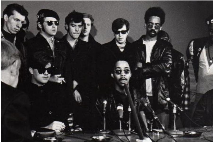
The original Rainbow Coalition.