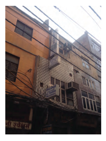
Figure 6: Skyscape gridded by wires, Dariba Kalan, 2014