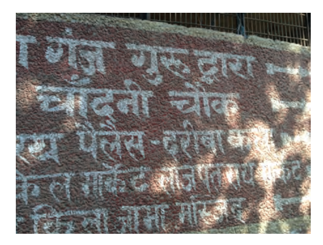
Figure 4: Signs to landmarks on a wall in Chandni Chowk, Dariba Kalan and other galis nearby, 2014