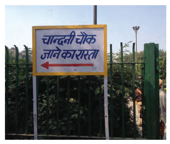
Figure 3: Trans. "The way to go to Chandni Chowk" outside the metro station, 2014