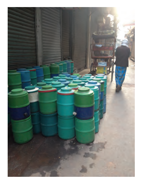
Figure I: A gali at 8am, Nov 2014

I was unfamiliar with, ignoring the "playful" element of the drift that encourages venturing into unknown sites; but if the sky was lit and the crowds were heavy, I would duck into a gali to familiarise myself with it and then walk out quickly. As Lefebvre points out with regards to himself in the aftermath of the May 1968 uprising in Paris: "In the street, a form of spontaneous theater, I become spectacle and spectator, and sometimes an actor" (Lefebvre 2003: 18).