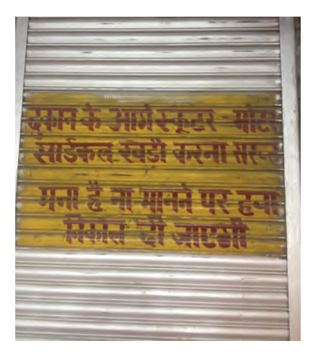
Figure 5: Trans. "It is absolutely forbidden to park scooters and motorbikes outside the shop. If found, the tyres will be deflated", Dariba Kalan, 2014