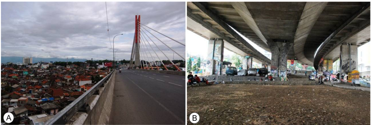
Fig. 1. (A) Upper Pasupati Flyover (2011); (B) Under Pasupati Flyover (2012).

In 2005, the City of Bandung constructed Pasupati Flyover over Tamansari valley and Bandung’s main river, the Cikapundung, to connect Pasteur Road in the eastern part of Bandung with Surapati road in the western part. Various impression given to this 2.5 km long flyover, built over 2.4 hectare areas, supported by 46 pillars - as a new icon for the city and an ugly eyesore. Built on the former densely populated Tamansari neighborhood of the Bandung Wetan, it displaced 300 households from RW 04, RW 11, and RW 15. They were relocated to Cisaranten, 10 km to the eastern part of the city (Yasin 2006). Ironically after the construction, the flyover created a zone of ‘dead space’ across part of the valley where residents had previously established communal, public spaces (Figure1).