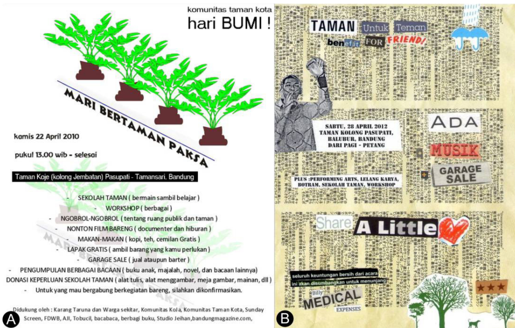
Fig. 3. (A) Event was commemorating Earth Day; (B) Fundraising event to support a friend who was ill