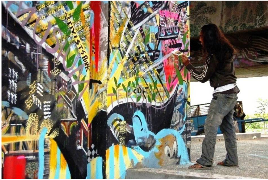
Fig.5. Local artists create works of art murals on the walls of the flyover pillars.