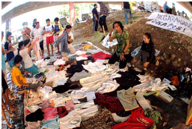
Fig.8. Lapak Gratis (free stall).

The presence of this self-organized community in the public space under the Pasupati Flyover has also encouraged other people to take the initiative to make effective use of this space. For example, the public gatherings under the flyover encouraged a group to build a mini soccer (futsal) field in the area (Figure 9). Although this involved a third party sponsor rather than the Komunitas Taman Kota, it demonstrates their success in developing the area into a magnet for the public. The addition of further public facilities and amenities can be expected to attract further interest from various groups, including commercial and government interests.