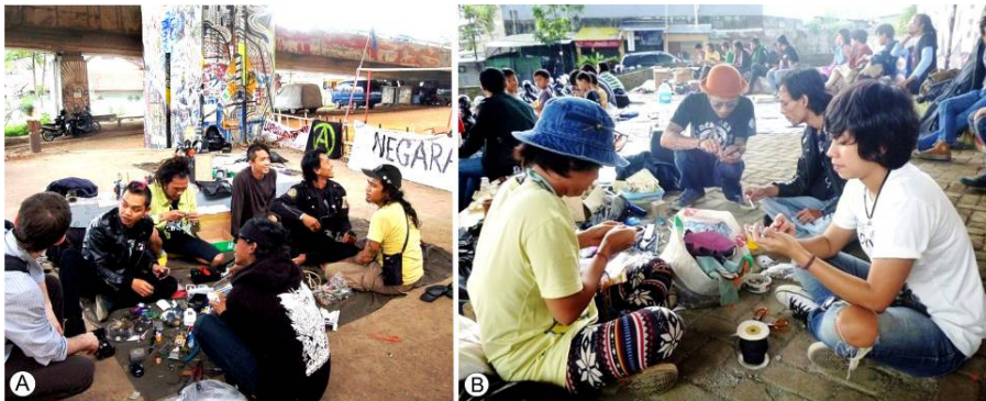
Fig. 6. (A) Punk Collective workshop to recycle electronic goods (2010) ; (B) Collective craft and knitting (2012).