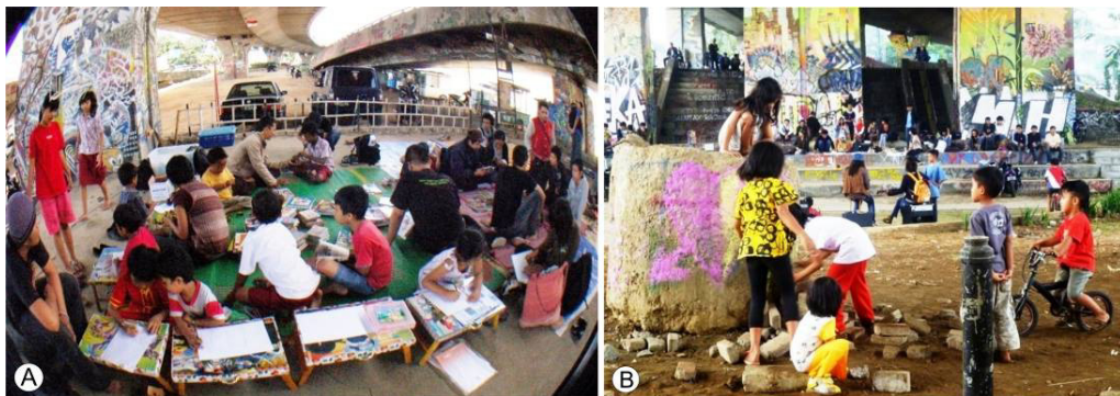
Fig. 4. (A) Sekolah Taman (Point 2 in Fig. 2) involving local residents from RW 04 (2010); (B) Sekolah Taman (Point 3 in Fig. 2) involving RW 11 (2012).

Through the school, children and others are given the freedom to respond to the space under the flyover by using it as a space for activities they enjoy, such as playing, drawing, reading, and more. The Sekolah Taman (Park school) program also draws on the work of a local artist affiliated with Komunitas Taman Kota who, since 2007, has used the flyover structure as a medium for his ‘street art’ (Figure 5). He has painted or plans to paint murals on 20 of the flyover pillars, starting with the pillar on Cihampelas to Tamansari road. These murals are voluntary works done by a single individual, without any commercial or government sponsorship. In his words, because the flyover provides a blank page, he feels that he has to decorate it.