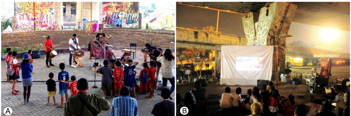
Fig. 7. (A) Filming video clips and workshop (2012); (B) Watching movies together under the flyover (2010).

At Taman Koje, it is not only abstract ideas and knowledge that is shared, but also material objects. Events called ‘lapak gratis’ (free stalls) are used to give away goods to those who might find them useful or interesting (Figure 8). This activity enabled individuals and groups to display a wide range of goods which they no longer need or want (or that they simply wish to give away for the pleasure of giving) so that anyone may simply take them for free. With the motto ‘take what you need and leave what you do not’, it is neither strict barter nor a commercial sale but a generalized gift exchange. The lapak gratis follows in the tradition of the ‘free markets’ which have been organized around the world as an alternative mechanism for exchange.