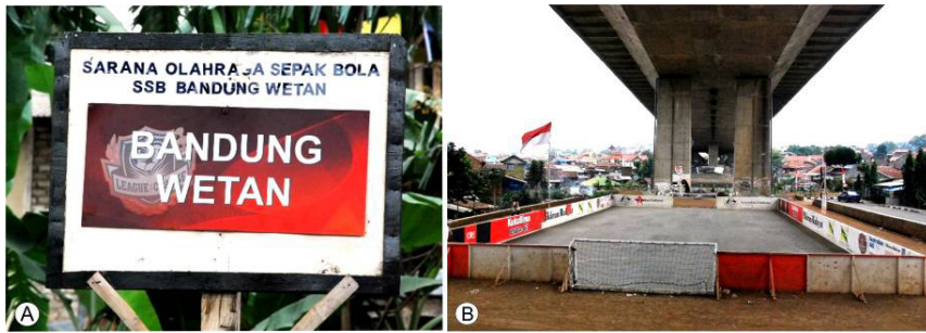
Fig. 9. Futsal sports facilities.

Komunitas Taman Kota itself organizes its modest activities, sometimes alongside other community groups, but without major sponsorship, as they are not seeking to promote a particular private interest. Rather, they simply want to share the space so that it can become a true ‘Friendship Park’ rather than just dead space under the flyover. So, as long as it remains publically accessible they are happy to accept the building of the sports area even though they were not directly involved in its construction.