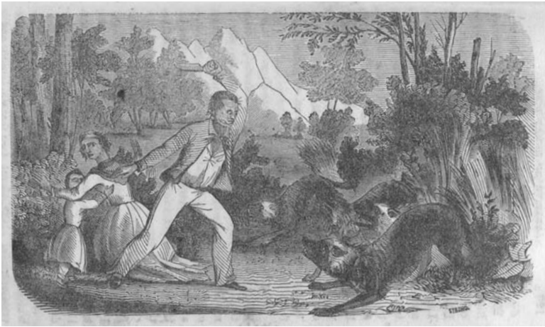
A Man Standing in Front of a Woman and Child Fighting Off Dogs. From Narrative of the Life and Adventures of Henry Bibb, Written by Himself.