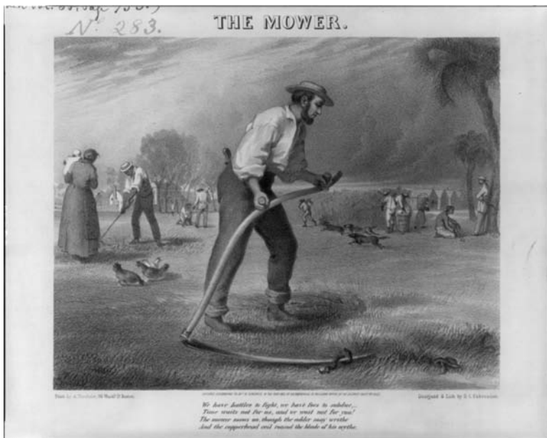
The Mower. Artist: Dominique C. Fabronius, circa 1863. Courtesy of Library of Congress, Prints and Photographs Division. LC-USZ62-55538.