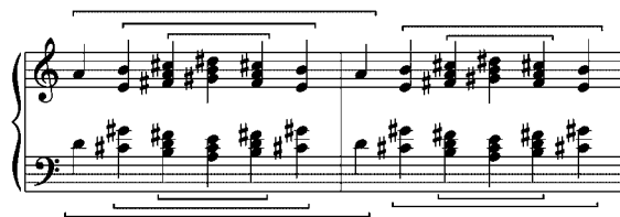
EXAMPLE 12 Palindromes in “Song in the Songless” introduction.

Tonal centers are created by the use of the ascending melodic second with pitches functioning as scale degrees 7–1 in the vocal line at four cadential points: “still they sing” (G–G#, with underlying harmony of D–F–A–C#–G#), “pass by” (C–C#, with underlying harmony of D–A–C#), “wake a sigh” (G–G#, with underlying harmony of E–G#–D), and “in me they sing” (C–C#, with supporting underlying of D–F–A–C#–E#) (see Examples 13a, 13b, 13c, and 13d). These cadences are also created by the repetition of the scale degree 1 pitch and by the pause of the vocal line after these repetitions.