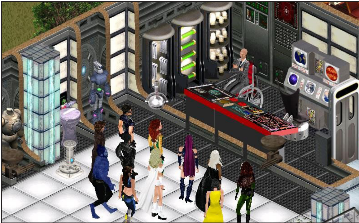
Fan-made X-Men Sims in a custom-made Danger Room. Screenshot from The Sims (Price, 2012).

degree on crowdsourcing and member participation; but it is the passionate drive of the fan themselves that ensures that projects such as the CTO Sims file archive survives. These Sims sites have become part playground, part repository for their members; places where they can mingle, relax and collaborate on projects as well as use the public service that the digital archives provide.