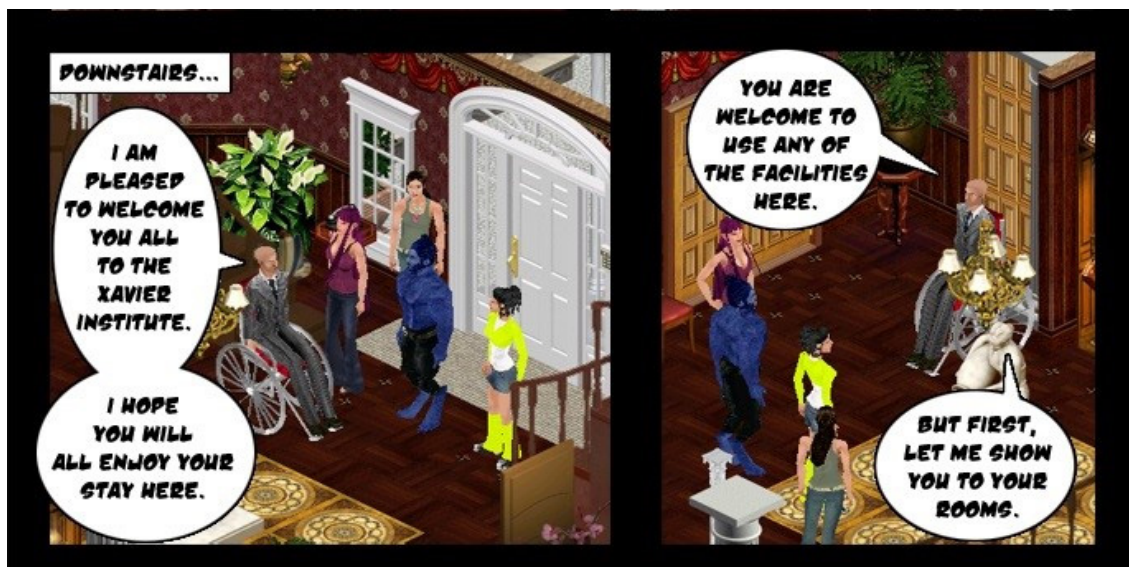
An example of an X-Men gamic using in-game screenshots from The Sims (Price, 2013).

This in itself should serve to demonstrate that this small group of Sims players is very precariously placed, a point that is magnified by the fact that The Sims itself is teetering on the edge of obsolescence. Thus far, players – through trial and error – have worked out methods of getting the game to play on the Vista, Windows 7 and now Windows 8 operating systems – but how long will they be able to keep the game abreast with modern technology? Will there come a time when it is simply too old to work on the latest computer? When emulation will be the only