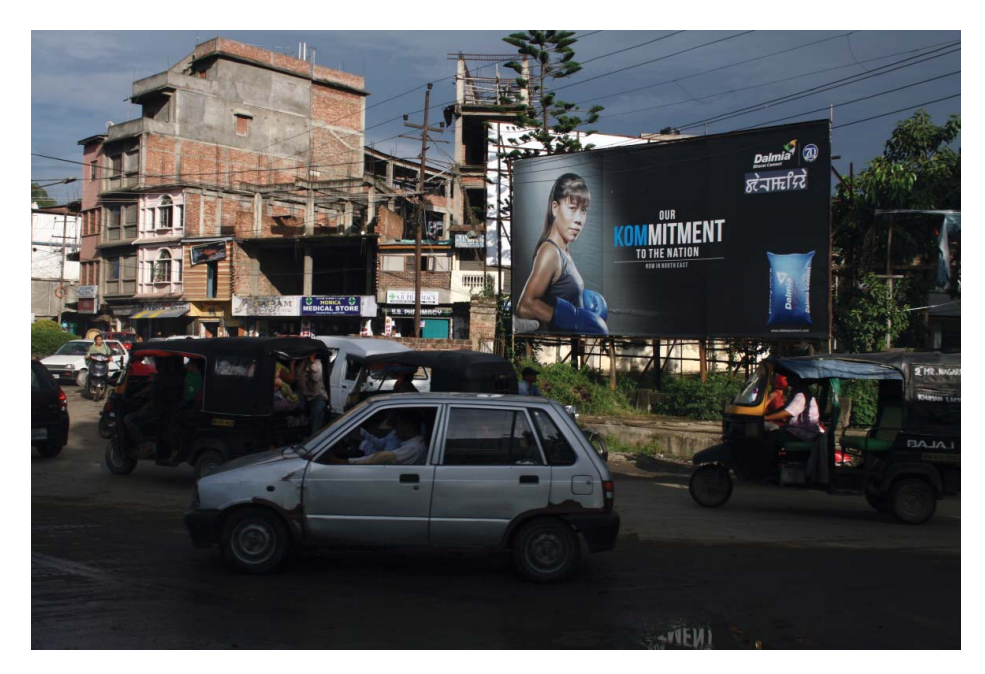
FIGURE 1. Mary Kom on a billboard in Imphal, June 2013.