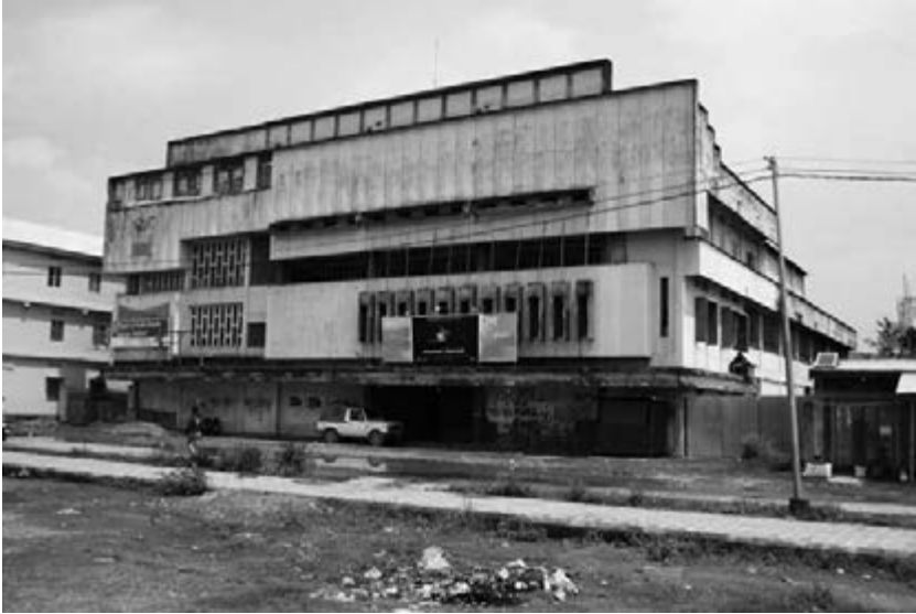
Image 1.1 Shanker Talkies, Lamphelpat