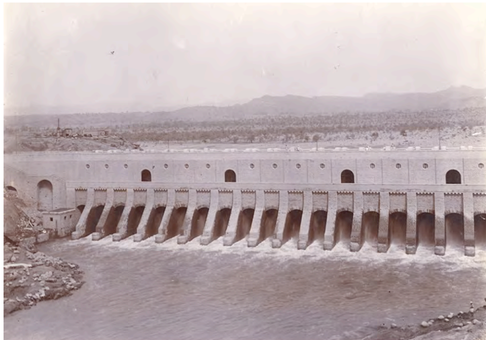
Figure 3. Upper Jhelum Canal regulator, date unknown. Louis Dane oversaw the construction of the canal and its many barrages during his tenure as Governor of the Punjab. It opened soon after Dane's retirement from India