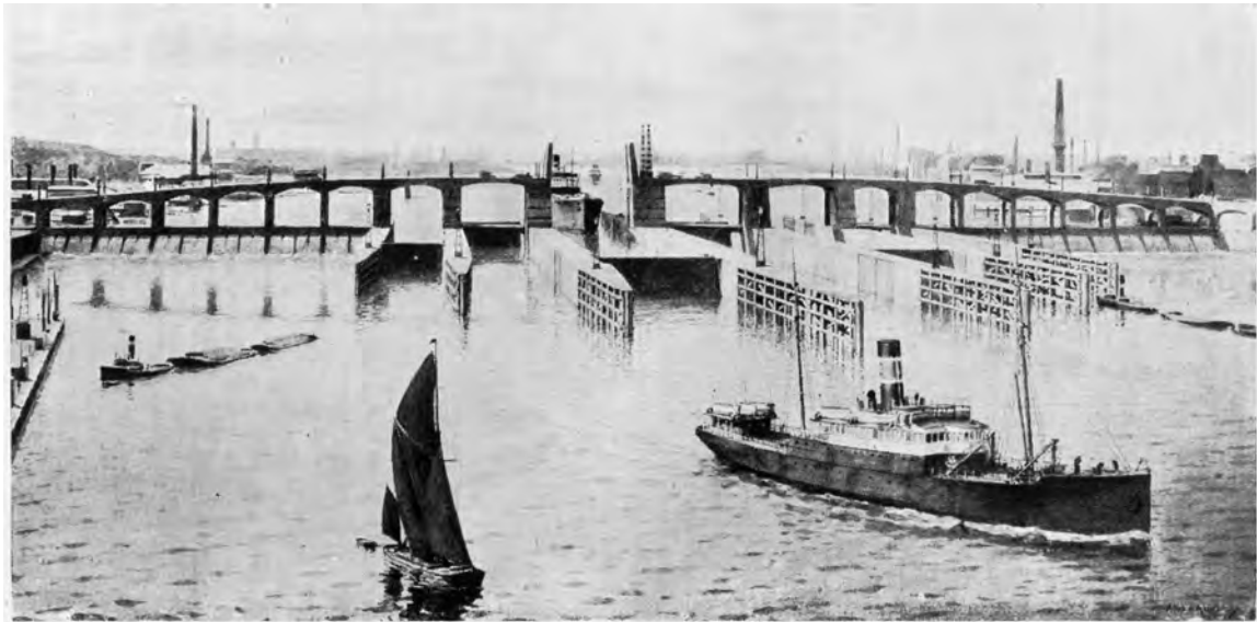
A THAMES BARRAGE AT WOOLWICH