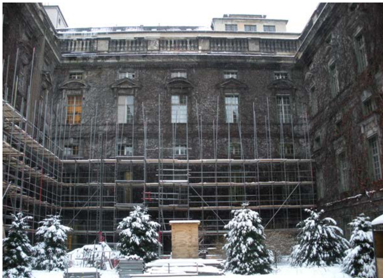
Apparently every library in the world is undergoing renovation