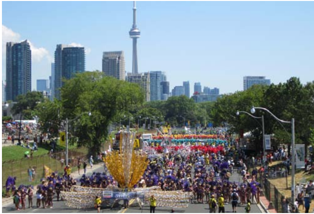
Scotiabank Caribbean Carnival Festival Parade. 27 July 2011.

While cultural conditions can proscribe women's sexuality and its expression, because the patriarchy defines the terms of being sexual, Judith Bettelheim contends that the female masquerader can use her sexuality to become an active agent (69). M. NourbeSe Philip writes about the empowerment women can experience as they play Mas during carnival: "Oh, for a race of women!—shaking their booty, doin their thing, their very own thing, jazzin it up, winin up and down the streets, parading their sexuality for two (w)hole days—taking back the streets making them their own" (107). In performance, "Josephine" actively claims space and female sexuality represented by breasts and buttocks, thereby denying their objectification. As such, "Josephine" avoids reifying and fixing understandings of Baker's body, but rather opens the discourse to multiple and "other" interpretations.