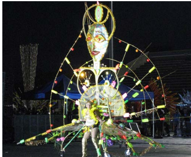
The follow spotlights catch the glitter and the structure of "Josephine" at the adjudication, 28 July 2011.