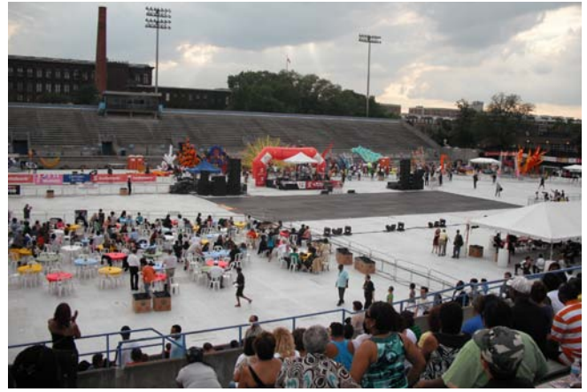
From the stands of Lamport Stadium watching the judging of the Mas for King and Queen. 29 June 2009.

TruDynasty's Queen Mas, "Josephine Dancing at the Market," creates a performative palimpsest that negotiates and shifts between both the historical and discursive understandings of Josephine Baker and the strategically reimagined Caribbean-inspired persona. Traces of Baker's iconicity are present in the design and the performance, notably in the representation of female sexuality, the breasts and buttocks, as well as the racialized undertones inherent in the bananas. Jackson's Caribbean reimagining creates a gestalt-like perceptual shift from exotic and primitive stereotypes to the familiarity of the Caribbean market. As such, alternative, carnivalesque understandings of the body emerge, highlighted by the grotesquely oversized breasts and backside of the design that festively bounce and gyrate in response to the performer's movements. These features also gesture to the potential for female agency, in the licensed time and space of carnival,