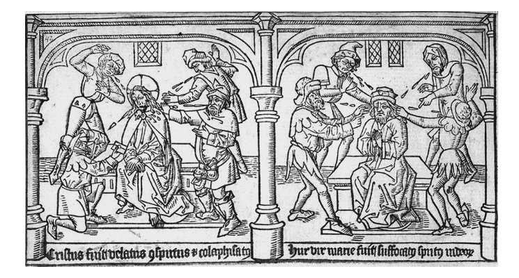
Figure 9.3 The Mocking of Christ and the Martyrdom of Hur. Dutch blockbook edition of the Speculum humanae salvationis, c. 1468–79