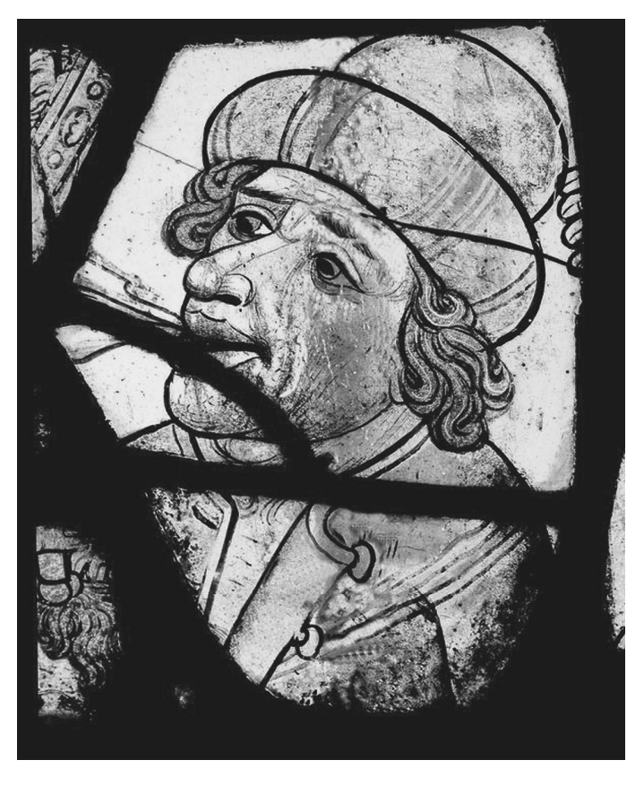
Figure 9.2 Jew spitting at Christ. Stained glass at Great Malvern Priory, Malvern

Taylor 17) includes a detailed miniature of two Jews spitting in Jesus' face alongside the following verse: 'The Iewes that spytte lorde i[n] thy face / All thou suffred and gaue the[m] grace / That I haue offended or ony me / Forgyue it lorde for that pyte' (7v).