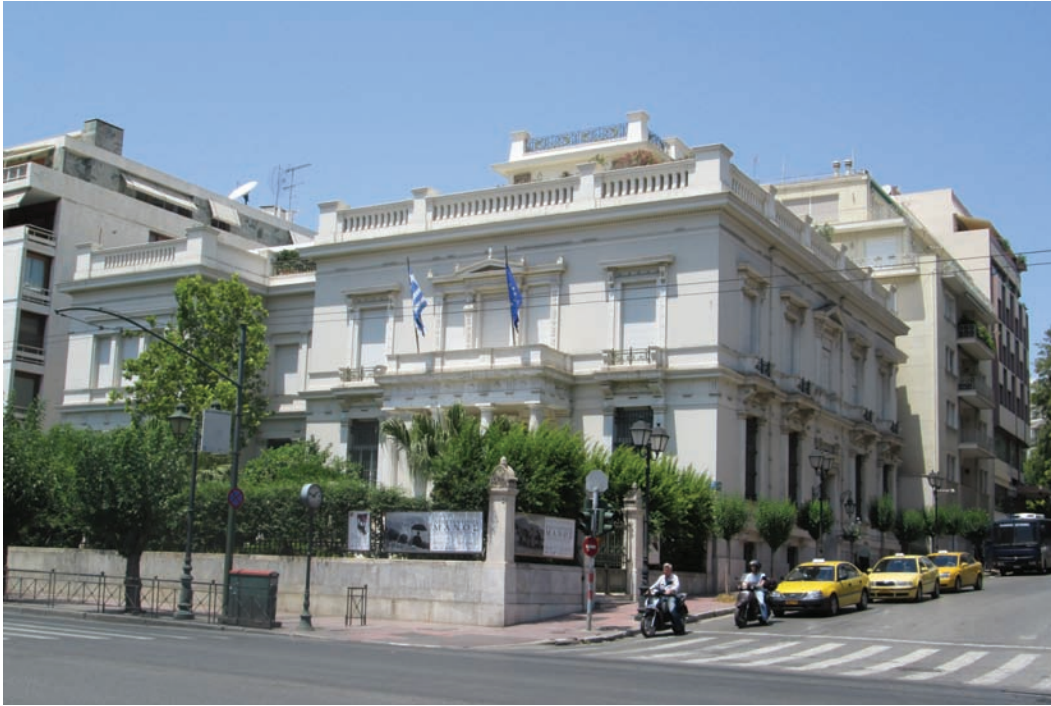
FIG. 1 A view of the main building of the Benaki Museum.