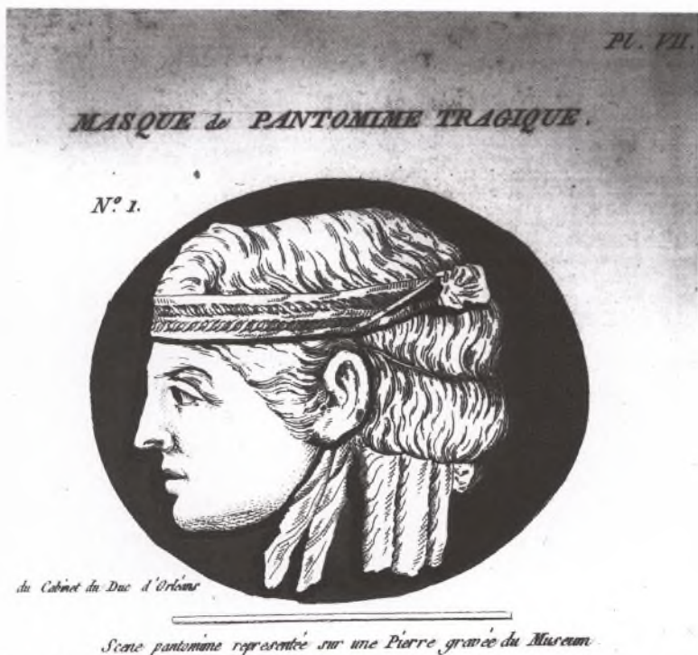
Figure 0.4 Engraving in François Henri Stanislas de l'Aulnay, De la Saltation théâtrale, ou recherches sur l'Origine, le Progrès, & les effets de la pantomime chez les anciens (Paris, 1790).

Pantomime masks, which were distinguished from tragic masks by their closed mouths and greater visual beauty, were depicted on monuments of the imperial era, 64 and have inspired artists and engravers since the eighteenth-century revival of interest in ancient pantomime (see Fig. 0.4). But the clothing and props used by the dancer have been less thoroughly investigated, even though the social language of costume was a fine science in imperial Rome. 65 Perhaps