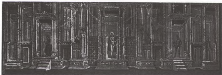
Figure 0.2 Wall painting, Pompeii 6.7.23 (House of Apollo or of A. Herennuleius Communis).

sets, 32 such a choice of internal decor may not be surprising in a community as stage-struck as Pompeii.