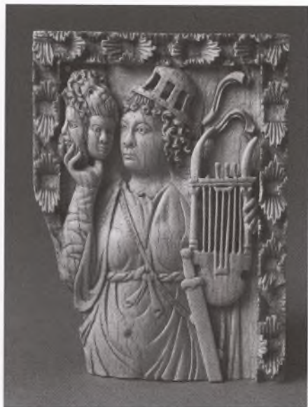
Figure 2.1 Late antique ivory plaque (late fifth century AD) depicting a pantomime dancer, found in Trier.

focus of discussion in the later sections. The evidence for costume is scattered through our written sources found in apologetic treatises, law codes, legal speeches, and theological writings. There is nowhere an extensive description of pantomime costume for its own sake, as there is, for example, of the pantomime's body; instead, the references are mostly limited to passing comments which satisfy the demands of the surrounding text rather than our demands to know more about costume! Nevertheless, the comments found in the textual evidence are sufficient to make it possible to piece together a reasonable reconstruction of what was worn by the pantomime dancer, and this picture can be corroborated and supplemented by the visual evidence for pantomime performers. This is primarily constituted by the six 'pantomime' medallions, the ivory plaque from Trier (see Fig. 2.1) and the two Pompeian wall paintings. 4