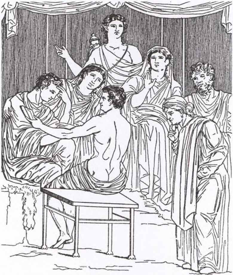
Figure 12.1 Drawing of the painting of Admetus and Alcestis (seated left) in the Basilica, Herculaneum (Naples Archaeological Museum).

from it—was being performed in Roman imperial times. The popularity of the Alcestis myth amongst theatre-mad citizens of the Roman Empire is also confirmed by its appearance in wall-paintings at Herculaneum and Pompeii (see Fig. 12.1), and Pompeii was a magnet for pantomime stars and their accompanying troupes. 11