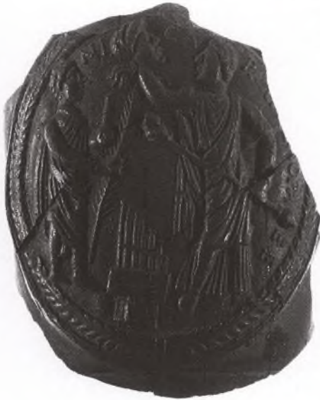
Figure 0.1 Appliqué medallion from Orange.

Ploutogenes, Pylades, Apolaustos, and Parthenopaeus are just four of the men who made livings from the fascinating art form investigated in this volume. Pantomime was central to Greek and Roman culture and represents a crucial phase in the history of theatre. A glamorous and alluring entertainment, its central attraction was a solo, masked male dancer—called a pantomimos , or often just a ‘dancer’ ( orchēstēs in Greek, saltator in Latin)—who performed famous stories from mythology. The dancer took all the important roles in each story, changing his mask for each one; this was how he derived his name as the one who mimed all ( panta ) the roles, or ‘everything in the story’. As several chapters in this book illustrate, the formal conditions under which he performed could vary enormously. He could dance in venues from vast open-air amphitheatres to private dining rooms. He was sometimes joined by an assistant actor, or groups of dancers of either sex. He could dance to the accompaniment of a large orchestra and choir, or a single musical instrument and a narrator or solo singer. The tone of the performances, it seems, could vary from danced drama on high-minded tragic themes, or on quaint Arcadian adventures involving Pan and satyrs, to risqué semi-pornographic masque. Ancient polemicists