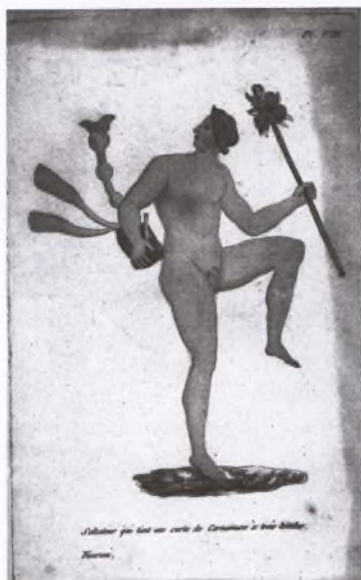
Figure 16.2 Engraving from François Henri Stanislas de l'Aulnay, De la Saltation théâtrale, ou recherches sur l'Origine, le Progrès, & les effets de la pantomime chez les anciens (Paris, 1790).