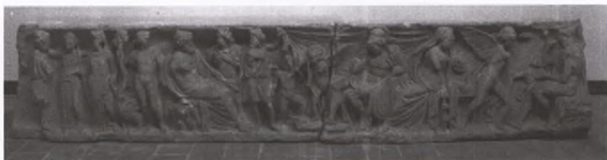
Figure 3.1 Sarcophagus showing myth of Aphrodite and Ares. Grottaferata, Museo dell' Abbazia.

This ability to let a single, essential idea override inconvenient aspects of the story-line is also seen in the treatment of other myths on sarcophagi, and particularly those that show great love affairs. A famous example in the Vatican Museums shows a man and woman portrayed as Achilles in the act of killing Penthesileia, where the overall message must have been the power of their love in the face of death, ignoring the mythological details. 41 This approach seems like a short-cut, easier version of the more sophisticated and complex readings that Koortbojian has shown to be possible for other presentations of myth on sarcophagi; as such, it might perhaps have something in common with the kind of understanding that pantomime could arouse in a fast-moving sequence of 'significant' episodes from myth. Here perhaps is an insight into the kind of mythological knowledge that Libanius sees as an educational benefit of pantomime—that it taught a repertoire of simplified stories of the past to the likes of goldsmiths who would not otherwise have had access to more exclusive forms of cultural instruction. 42