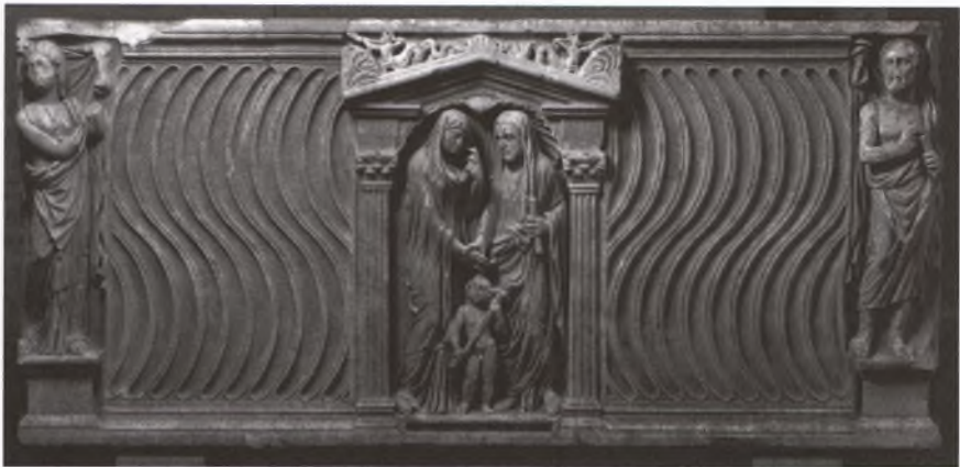
Figure 3.2 Strigillated sarcophagus, Munich Glyptotek inv. no. 533.

divided the front into smaller panels which needed only a few, immediately recognizable figures. 52 Sometimes the most significant episode was highlighted in a central niche, as on the strigillated sarcophagus shown in Figure 3.2. 53 This typical arrangement, with subsidiary scenes in the two corner panels, creates a tripartite framework which, for Turcan, recalled the architecture of the theatre back-drop. 54 Perhaps more immediately akin to the theatre was the use of formulaic poses and distinctive attributes to identify the protagonists in these economically depicted scenes, and to convey a sense of their actions in a way that made them easily and speedily recognised.