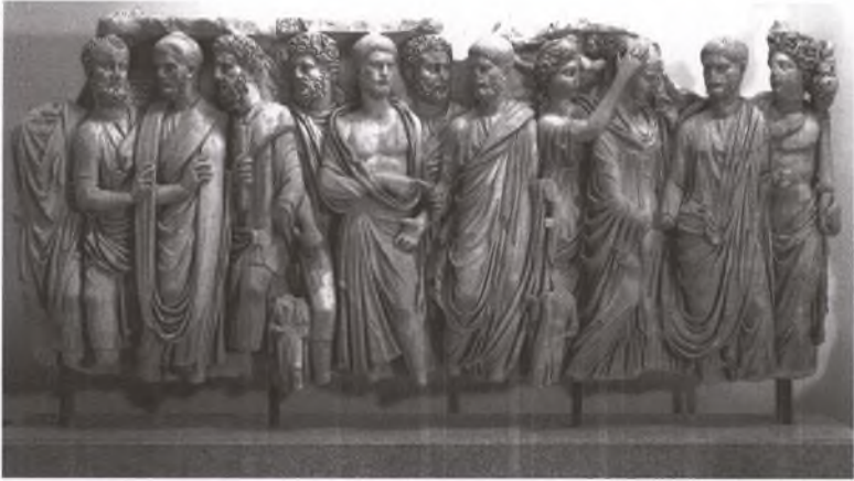
Figure 3.3 Biographical sarcophagus, Naples, Museo Nazionale inv. no. 6603.

On sarcophagi, therefore, multiple identities (including cross-gendered ones) were positive features and an effective means of evoking the multi-faceted life of the model citizen. Their acceptability as a visual device is in obvious contrast with the negative evaluation often articulated in moralising discourses of the dancer's many roles. Yet could it be that familiarity with pantomime performances was a factor in the preparation of viewers of sarcophagi in the perception, understanding, and appreciation of the series of figures that confronted them? 87