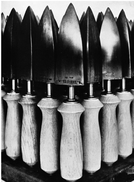
Figure 1. “Bügeleisen für Schuhfabrikation. Fagus-Werk Benscheidt in Alfeld.” Albert Renger-Patzsch, Die Welt ist schön . Plate 93. © 2013 Albert Renger-Patzsch Archiv / Ann u. Jürgen Wilde, Zülpich / Artists Rights Society (ARS), New York