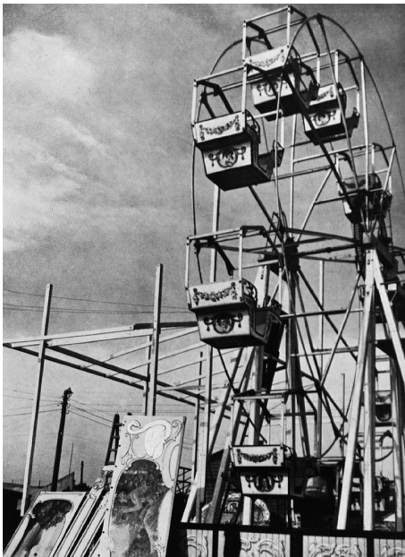
Figure 5. "Russische Schaukel wird montiert." Albert Renger-Patzsch, Die Welt ist schön . Plate 81. © 2013 Albert Renger-Patzsch Archiv / Ann u. Jürgen Wilde, Zülpich / Artists Rights Society (ARS), New York