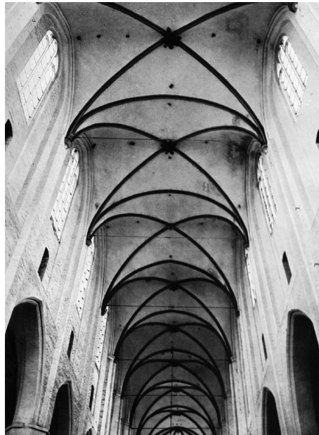
Figure 2. “Gewölbe des Mittelschiffs der St. Katharinenkirche in Lübeck.” Albert Renger-Patzsch, Die Welt ist schön . Plate 94.

example, the struts and supports of an empty Ferris wheel (Figure 5) recall the lines and lattices of a preceding series of images of industrial equipment (Plate 78, and Figures 3 and 4), a point reinforced by the alienating framing and abandoned impression of the ferris wheel. An immediate association provoked by the visual similarity of these machines at rest is the fundamental indistinction between machines that move material for production and those that move people for amusement. This association carries over to the following image of a merry-go-round, where the close cropping, the prevalence of dark tones, and the stony folds of a lowering curtain add up to an eerie stasis rather than pleasant motion—the frozen rictus of the horses suggests the terror of impalement far more than the joy of galloping (Figure 6).