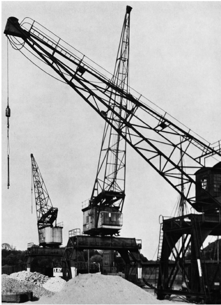
Figure 3. "Kranreihe im Lübecker Hafen." Albert Renger-Patzsch, Die Welt ist schön . Plate 79. © 2013 Albert Renger-Patzsch Archiv / Ann u. Jürgen Wilde, Zülpich / Artists Rights Society (ARS), New York