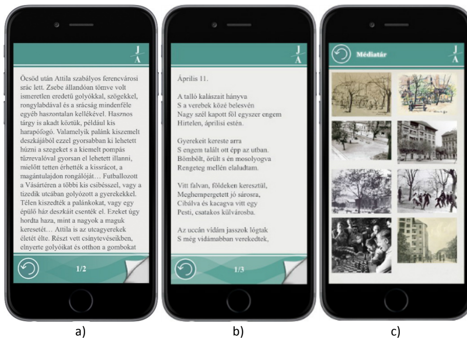
Fig. 2. a) Quotations from Jolán József. b) Part of a poem. c) Image gallery.