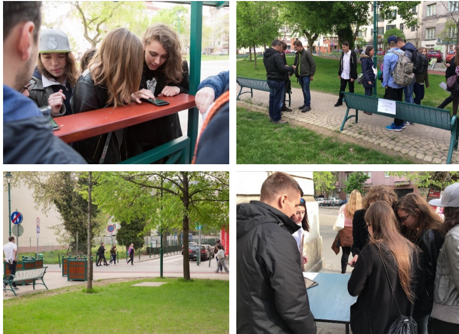
Fig. 4. The route of the walk and pictures taken during the competition.