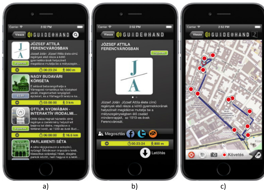
Fig. 1. a) List of the walks in GUIDE@HAND Budapest; b) Description of the walk “József Attila in Ferencváros”; c) Route of the walk.

In Ferencváros the researchers could establish 19 venues where the connection to the poet is verified - of these there are 11 places which are presented during the walk. Orientation is being helped by a downloadable interactive, digital Budapest map, in which the route of the walk can be followed, furthermore, the respective stops of the walk also appear. During the walk by clicking on the book icon the audio material can also be read, thus details of interest or information can be searched back whenever the user chooses to do so. The duration of the literary walk is approximately 90 minutes, but it can be stopped and continued any time. The venues already visited are recorded by the program, so the walk can easily be continued.