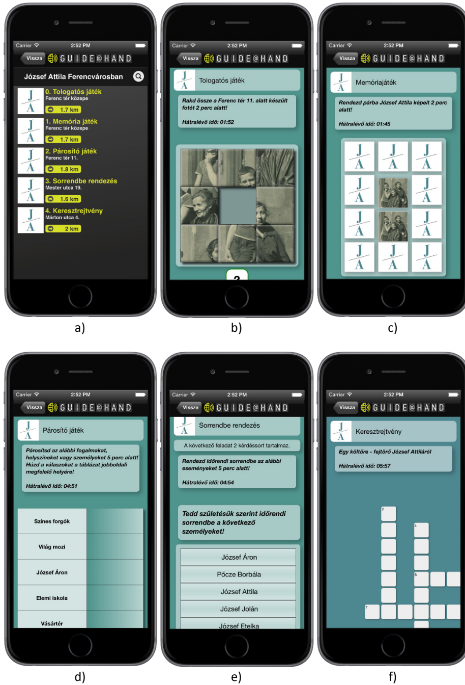
Fig. 3. a) List of games. b) Sliding puzzle. c) Memory game. d) Matching. e) Ordering. f) Crossword