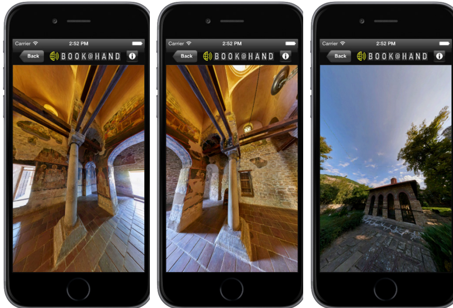
Fig. 4. Screenshots from panorama pictures in BOOK@HAND BIDL