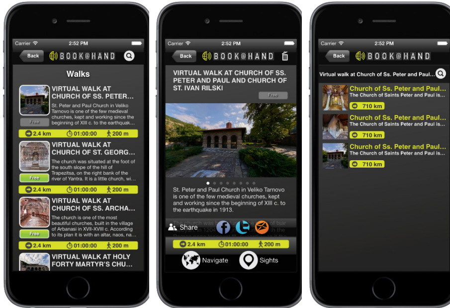
Fig. 3. Panorama walks in BOOK@HAND BIDL

The mobile devices provide new way of interactions with panorama pictures by using the mobile device's motion sensors. The visible part of the panorama can be automatically moved as the user turn with the smart phone by using the mobile device's motion sensors. This presentation mode provides a realistic impression where the proper part from the panorama picture is presented on the screen, which belongs to the current view direction of the user (Fig. 4). Several new details become available about the sights by tapping the "i" (information) icon above the panorama picture.