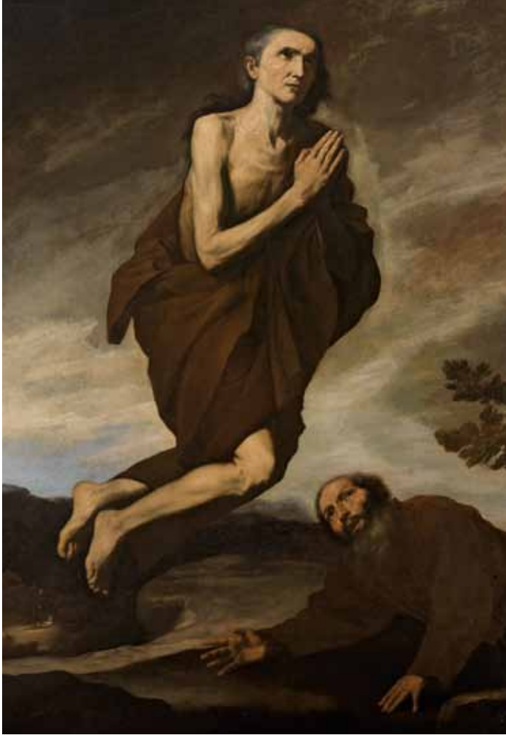
Jusepe de Ribera, Saint Mary of Egypt in Ecstasy, c. 1640. Oil on canvas. Colección Pérez Simón, Mexico City.

Ribera's singular style was more attributable to his own individual sensibility than to any nationalistic artistic conventions, however. The painter pushed the boundaries of naturalism in terms of both subject matter and painterly device. Although Ribera worked in various modes of painting, from genre to mythological and biblical scenes, the brutal realism with which he painted martyred saints earned him a reputation in the seventeenth century as "the cruel Ribera." This notoriety carried on through centuries. In the nineteenth century, Lord Byron wrote in his poem Don Juan that Ribera had "tainted His brush with all the blood of all the sainted," summarizing Ribera's deeply incised reputation as a painter of violent martyrdom and mythological torture.