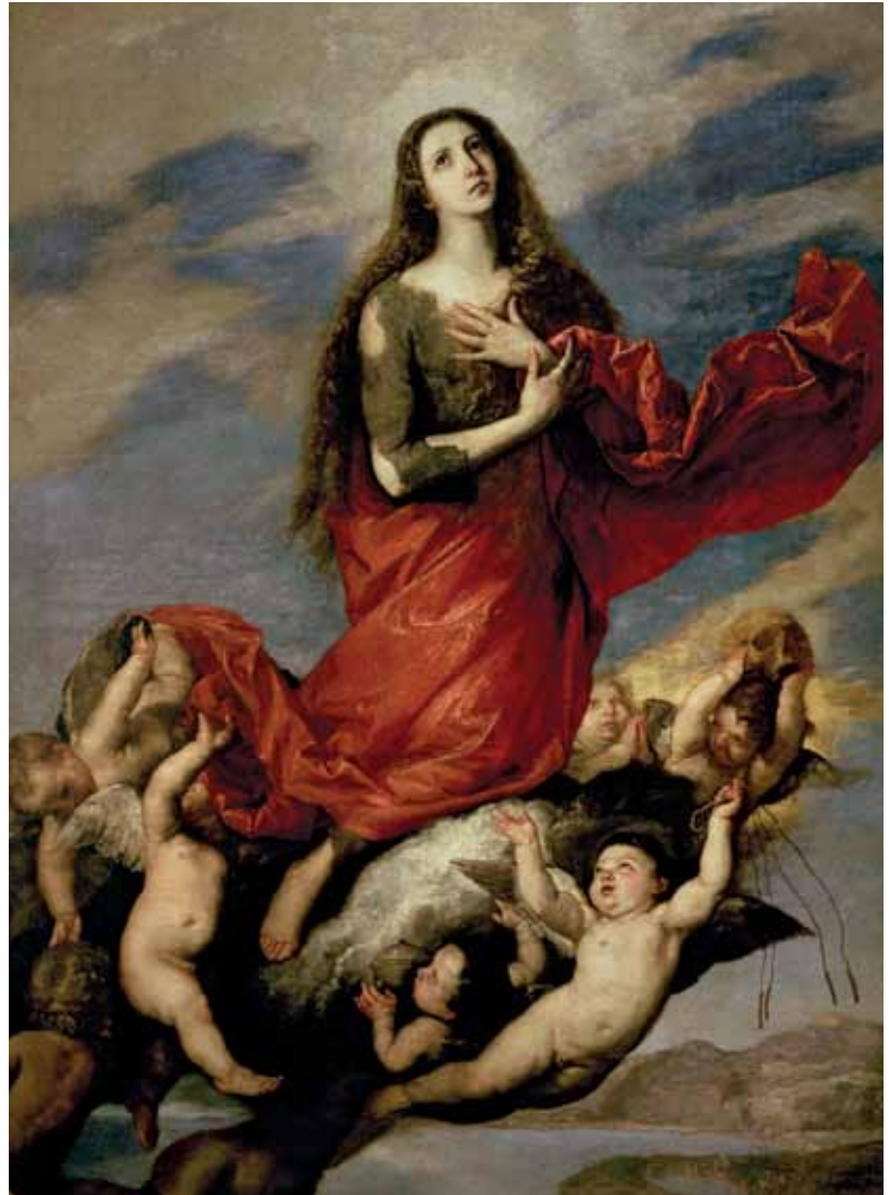
Jusepe de Ribera, Assumption of the Magdalene , 1636. Oil on canvas. Museo de la Real Academia de Bellas Artes de San Fernando, Madrid, 636.

Beyond socioeconomic concerns, Ribera's dualistic identity was manifested in the style of his painted canvases and graphic works. His art was thoroughly affected by Caravaggio's brand of chiaroscuro , identified by the illumination within a painting via an overhead light source. The influence of Caravaggio's