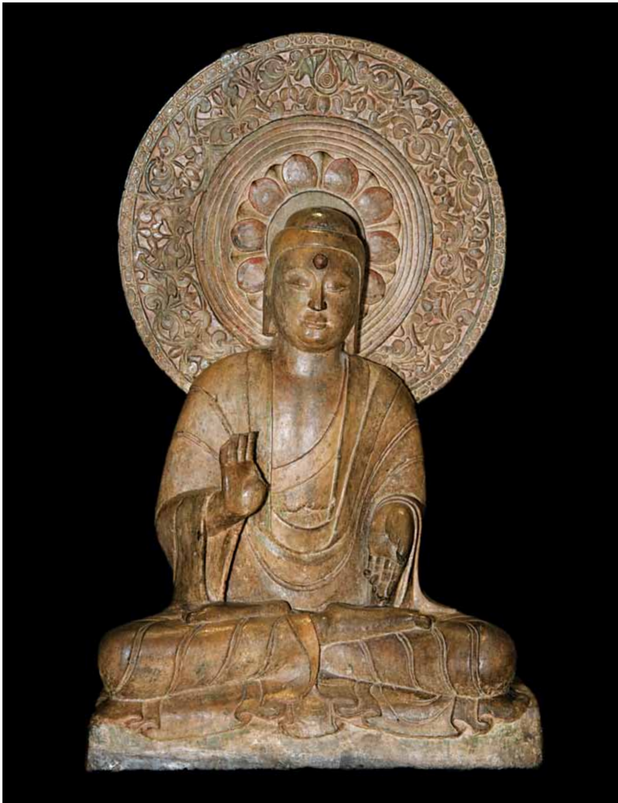
Seated Buddha , sixth century. Limestone freestanding sculpture with traces of pigment and lacquer. Xiangtangshan, northern group of caves, attributed to North Cave, perimeter wall niches. Victoria and Albert Museum, London. Presented Through the National Art Collections Fund by a Body of Donors, A4-1924.