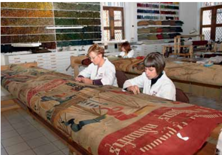
Conservation of the tapestries: Process of stabilizing the fragile parts of the fabric tapestries on the restoration benches. Collegiate Church of Our Lady of the Assumption, Pastrana, Spain.

The exhibition is organized by the National Gallery of Art, Washington, and the Fundación Carlos de Amberes, Madrid, in association with the Embassy of Spain, the Spain-USA Foundation, and the Embassy of Portugal and with the cooperation of the Embassy of Belgium and the Embassy of Morocco in Washington, D.C. Generous financial support from The Meadows Foundation has helped to make the Dallas venue possible.