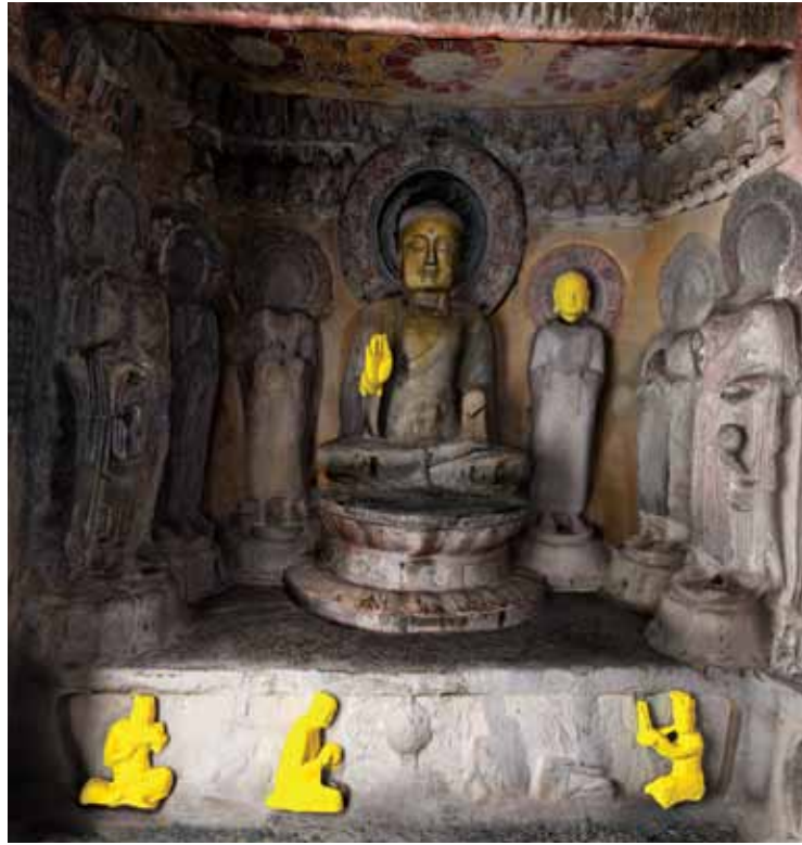
Still of screen from Digital Cave: view of north altar of the South Cave, northern Xiangtangshan, with 3-D reconstruction of dispersed sculptural fragments shown in yellow against colored (texture-mapped) cave setting.

The works on view are on loan from the Asian Art Museum of San Francisco, the Cleveland Museum of Art, the Metropolitan Museum of Art, the University of Pennsylvania Museum of Archaeology and Anthropology, the San Diego Museum of Art, the Victoria and Albert Museum, and the Virginia Museum of Fine Arts. ■