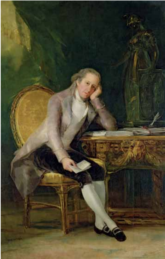
Francisco José de Goya y Lucientes (Spanish, 1746-1828), Gaspar Melchor de Jovellanos, 1798. Oil on canvas. Museo Nacional del Prado, Madrid, P 3236.