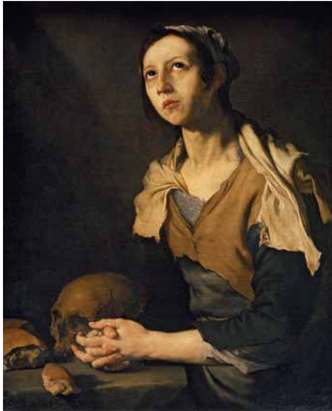
Jusepe de Ribera, Saint Mary of Egypt, 1651. Oil on canvas. Museo Civico Gaetano Filangieri, Naples, 1440.