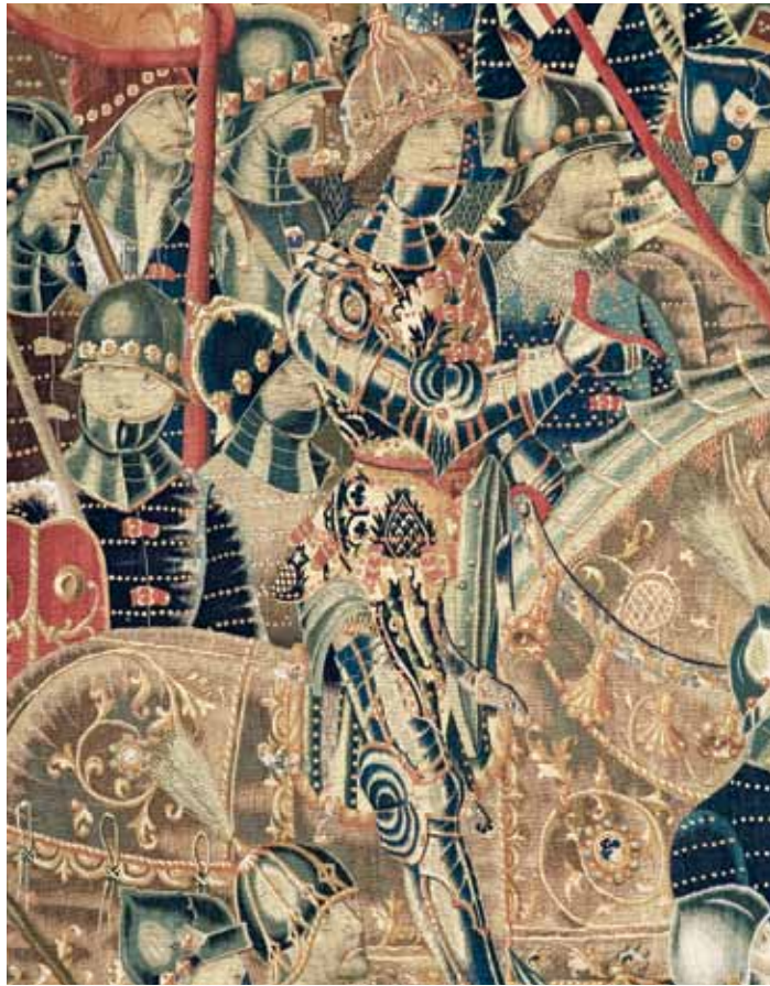
Siege of Asilah (detail) . Attributed to the workshop of Passchier Grenier, Tournai (Belgium), last quarter of the fifteenth century. Wool and silk. Collegiate Church of Our Lady of the Assumption, Pastrana, Spain.

Ostensibly a fight of faith, Afonso’s Moroccan invasion was also a victory for Portugal’s expansionist policies. Three of the four tapestries narrate respectively the Portuguese landing, siege, and triumph at Asilah in 1471. Once Asilah fell, Tangier—the Portuguese occupation of which is the subject of the fourth tapestry—was in no position to resist the Portuguese.