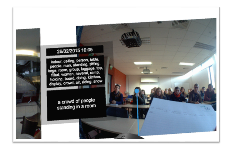
Fig. 3. VR Lifelog Prototype - Tooltip

ration. This was the first prototype developed and was part of an evaluation to compare the speed and efficiency of executing typical lifelog interaction queries on a conventional platform compared to a virtual reality platform.