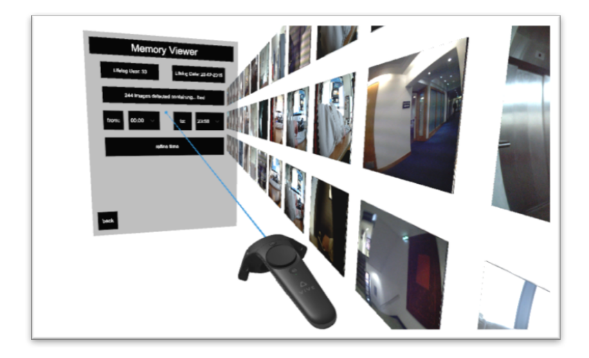
Fig. 2. VR Lifelog Prototype - Billboard Menu

accomplish this, the user interface is presented as a virtual menu in the virtual environment and is divided into three sections: a date selector, a concept selector and a time range selector. The interface can be presented to the user in two different orientations depending on their preference. One orientation is directly attached to the user's wireless controller and is interacted with by pointing the opposing controller at the menu which will generate a blue beam that highlights the interactive elements. We refer to this as the 'clipboard' menu (see Figure 1). The other orientation works in a similar fashion, however the interface is presented at a distance in front of the user and in a magnified form. We refer to this as the 'billboard' menu (see Figure 2).