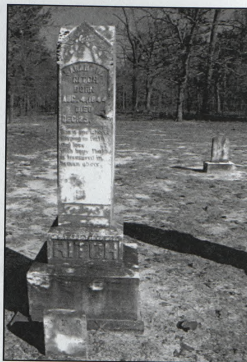
Fig. 5. Grave of Sarah W. Ritch