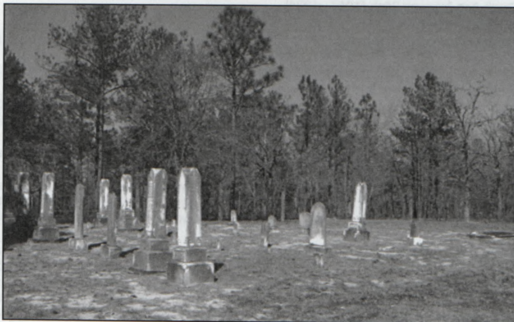
Fig. 1. Ritch Family Cemetery

In conclusion, cemeteries are very valuable research sources. While many of Muscogee County cemeteries have been documented, there remain so many more people – loved ones, friends, strangers – who need to be memorialized. One of my favorite "thank you's" for photographing a gravesite came from a lady in Pennsylvania who emailed me the following: "I can only say 'Thank you,' but my heart says so much more! My mother is 81 and suffers from Alzheimer's - she has mentioned more than once that she would like to visit her parents' and sister's graves again before she dies. I'm unable to grant her that wish, but now I can show her these photos. Maybe it will bring her some satisfaction. Thank you!" (Name withheld)