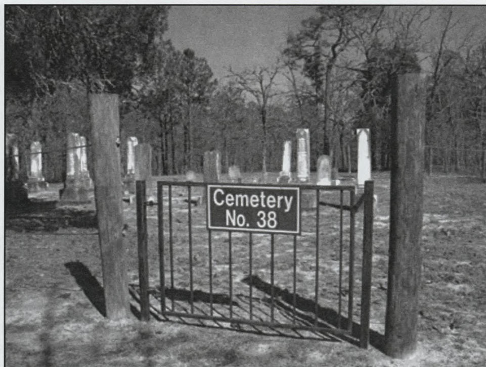
Fig. 2. Fort Benning Cemetery No. 38