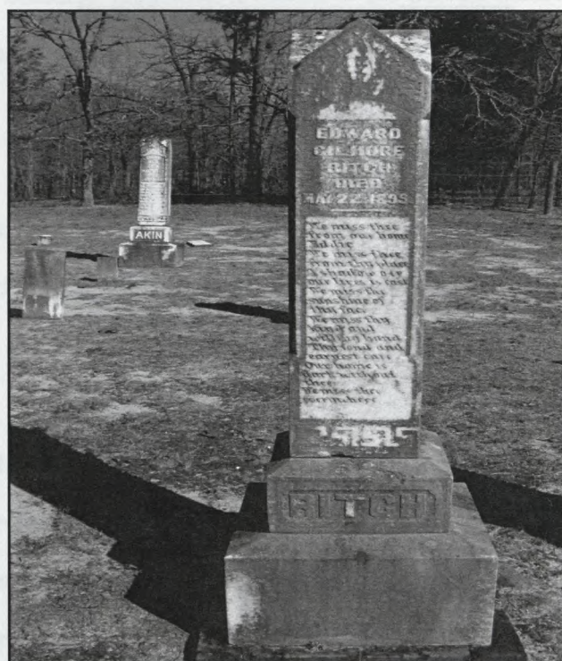
Fig. 3. Grave of Edward Gilmore Ritch