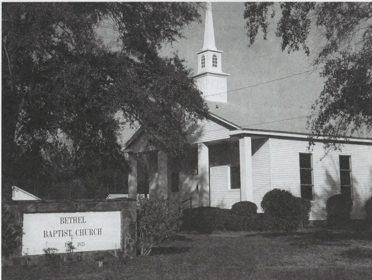
Fig. 1. Bethel Baptist Church