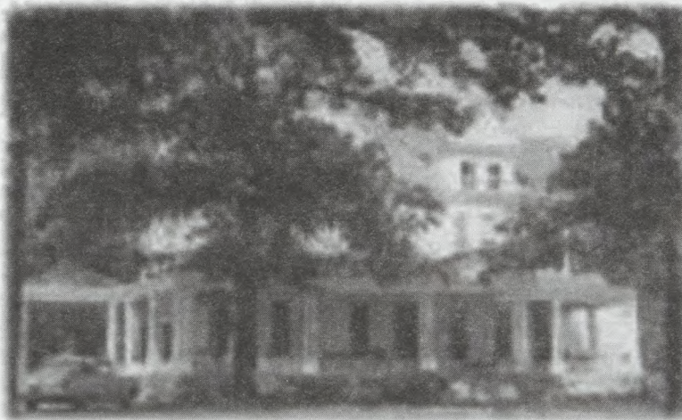
Fig. 2. Hill House