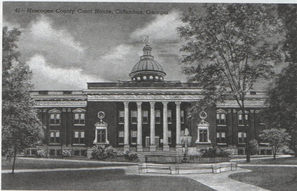
Muscogee County Court House