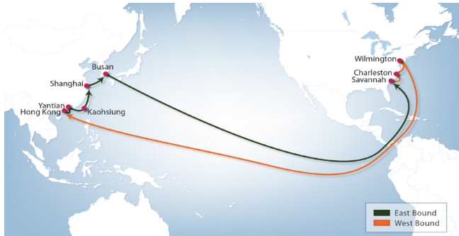
Figure 2: AWY All Water East Coast Service III of Hanjin Shipping