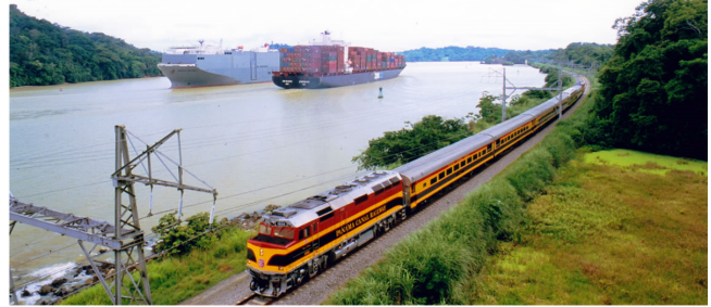
Figure 5: Panama Railway together with the Panama Canal.

It is a common case that uses to happen in Panama. As well the berthing schedules of the liners "could be" the main tool of the intermodal system. But that is the reason why the Panamanian connectivity is a "dynamic" concept with a basic