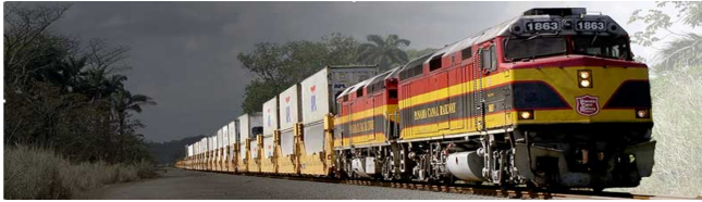
Figure 1: The Panama Railway.