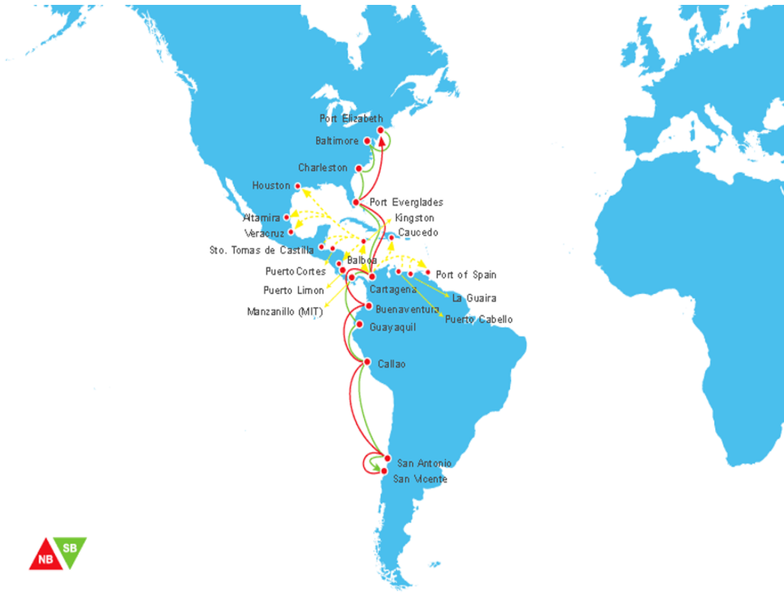
Figure 3: Weekly America’s Service of CSAV shipping company.