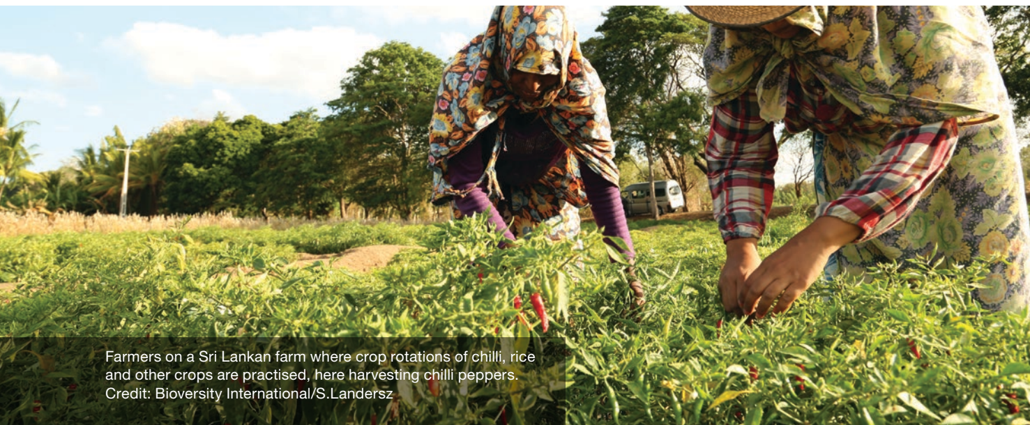
Farmers on a Sri Lankan farm where crop rotations of chilli, rice and other crops are practised, here harvesting chilli peppers.

biodiversity and function, pollution of drinking water and impacts upon water-based industries and recreation (16). Simplification of cultivated crop diversity and increasing crop specialization may contribute to decreased dietary and nutritional diversity (17, Chapter 2 this publication). The adoption of new agricultural practices has also had profound negative social effects within farming households and communities, such as increased gender inequalities due to women's limited access to labour, land, inputs and assets (18, 19).