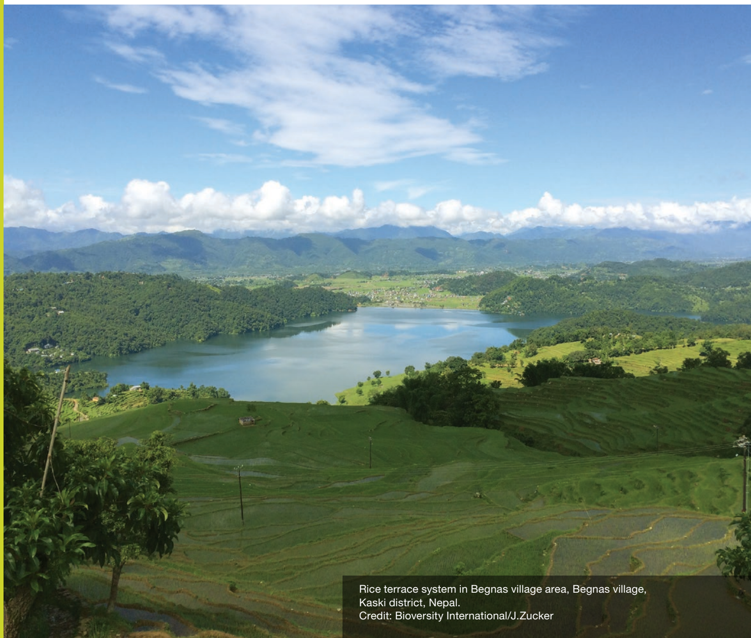
Rice terrace system in Begnas village area, Begnas village, Kaski district, Nepal.

expensive and frequently environmentally damaging external inputs. However, despite the increasing calls for sustainable intensification, conventional forms of intensification (reliance on synthetic external inputs, system homogenization and simplification) still hold sway, and agricultural biodiversity is not yet automatically included in sustainable intensification discourse, policy and management. Consequently, there is an urgent need to: (i) increase the profile of agricultural biodiversity as a multi-pronged solution to several pressing issues in global agriculture, (ii) become more adept at measuring it, its impacts and how it can best be integrated into a range of farming systems of differing degrees of intensification, and (iii) ensure that agricultural biodiversity is much better and more explicitly represented in agricultural policy, extension and incentive mechanisms.