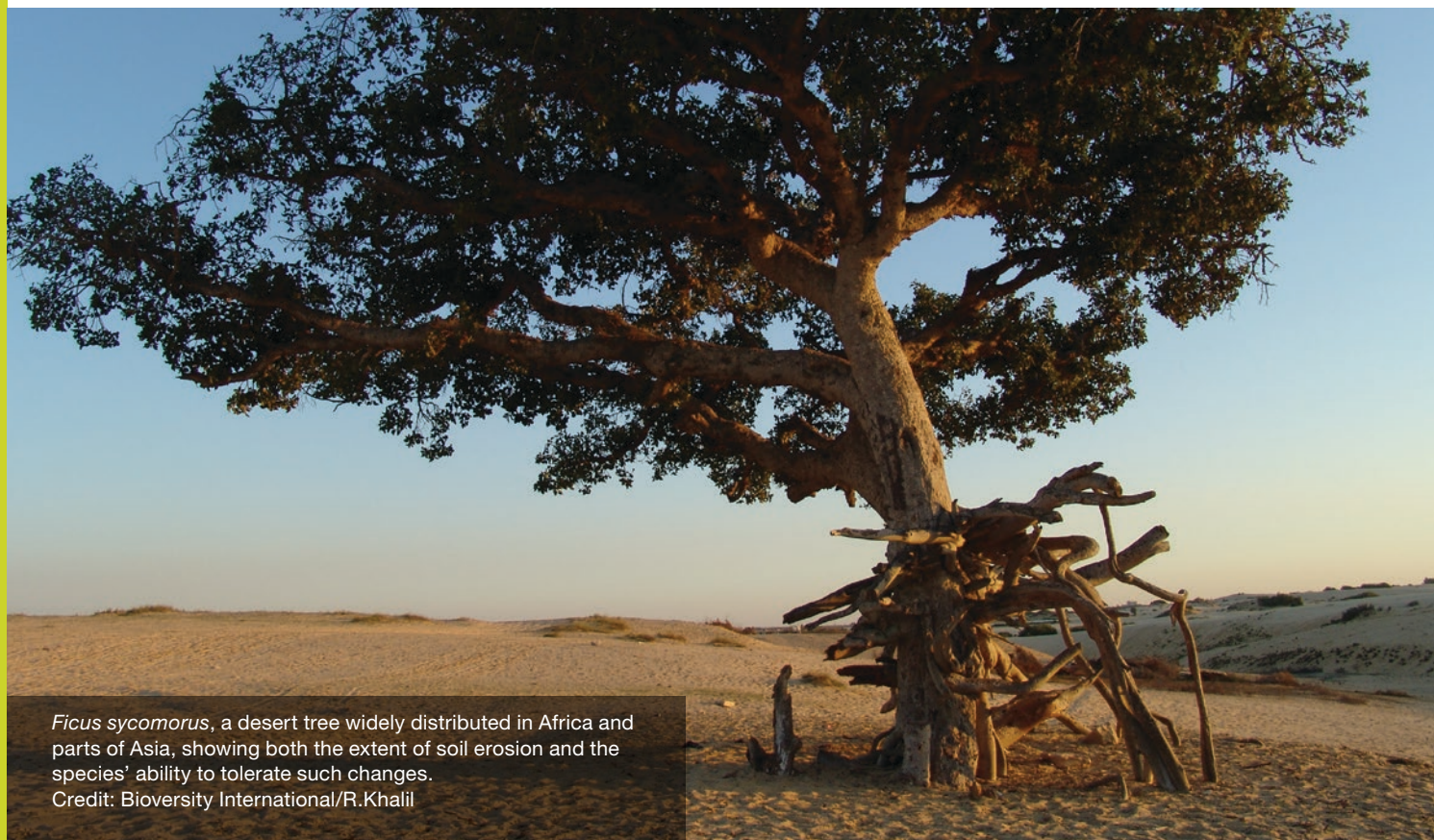
Ficus sycomorus , a desert tree widely distributed in Africa and parts of Asia, showing both the extent of soil erosion and the species' ability to tolerate such changes.

An array of processes associated with agricultural land-use changes and management threaten soil biodiversity, and therefore have the potential to impair ecosystem services: use of genetically modified organisms, habitat fragmentation, introduction of invasive species, climate change, soil erosion, soil compaction and organic matter decline (109). The more intensively managed the land, the fewer species and individuals of decomposer taxa (e.g. millipedes, springtails) (53). Specific agricultural management actions can also impact upon soil fauna, including soil tillage and insecticides. Tillage is generally negative for soil biodiversity, although it depends on soil texture and depth (110). In a study in Zimbabwe, soil tillage reduced the abundance of several groups of soil macrofauna (ants, termites, beetles, centipedes) that perform a range of ecosystem services (e.g. increased water infiltration, pest predation) in agricultural systems (111). Regarding insecticides, neonicotinoid pesticides can have a severe negative impact on soil fauna (112). Organic production is associated with higher levels of soil diversity than conventional farming (87).