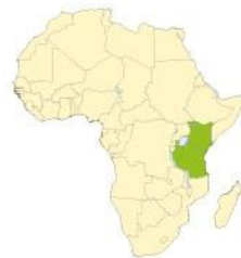
Kenya and Tanzania