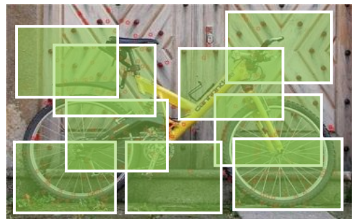
Fig. 1. Multiple-windows set on an object image.