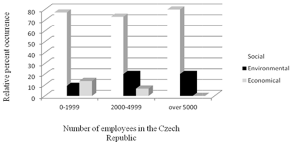
Fig. 2: Main areas of interest of companies

It is not surprising that 77 % of the companies from the selected sample aim most of the performed responsible activities at the social area. One of the reasons may be the fact that the efforts aimed at the social area (i.e. focus on the local community and employees) are “most visible”. The following graph elaborates these issues in more detail and shows the main areas of interest of the companies in categorisation according to the number of employees in the Czech Republic.