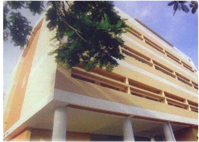
Figure 2: WBREDA Building, Kolkata

conservation drive throughout the country before the advent of LEED rating systems. The other one boasts the new growth of the IT sector in Kolkata.