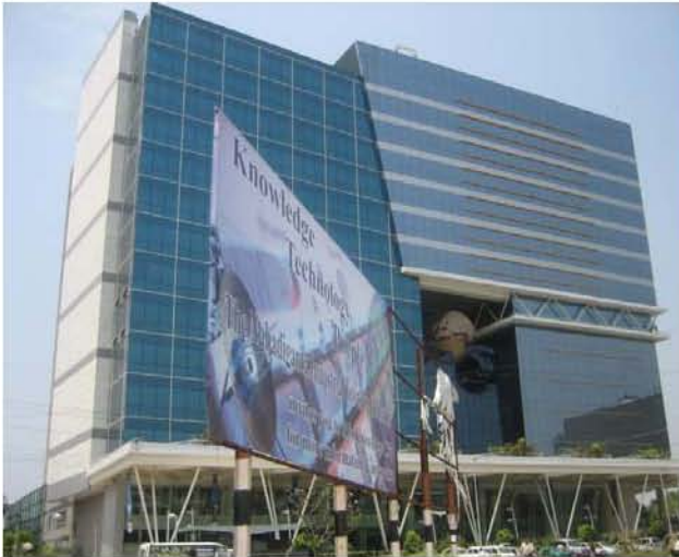
Figure 3: Technopolis, Kolkata

As stated earlier, the climate in Kolkata is warm for a greater part of the year and almost comfortable for the rest of the year. Mechanical heating is the least important factor to be concerned about while designing the HVAC system. For cooling, again, since the temperature is not very high, provision of natural ventilation and shade does half the job. Hence, the WBREDA building should achieve more points than Technopolis for this category. It will not be irrelative to mention that even the most efficient and economic mechanical HVAC system cannot match the energy saving of natural ventilation, as it will always require some energy to run itself.