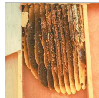
Bees can construct large wax nests rapidly once they enter a home. For this reason, both bees and nests should be removed as soon as possible.

Social wasps are quick to sting when defending their nests. Their attacks can be severe because they cooperate to defend the nest and because individual wasps can sting repeatedly. Honey bees can sting only once. Texas Cooperative Extension publication L-1828, Paper Wasps, Yellowjackets and Solitary Wasps , provides more information on wasps.