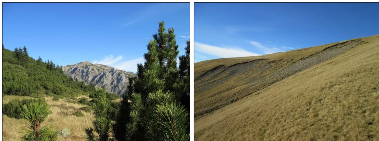
Fig. 2 Environment of the sampling sites (left side: juniper forest and Festuca meadows, characteristic for samples 1, 2, 3, 5 and 6; right side: eroded mountain slopes in the case of sample 4)

et al., 1982; Tulucan et al., 1999), as can be seen in Fig. 2 (left). The climate is continental and typical for high mountain areas (Povară and Ponta, 2010). Prior to sampling, weather was stable with constant atmospheric pressure. There was no record of rainfall or snowfall that could have produced signs of indirect contamination (e.g., acid rain or residual grazing waste).