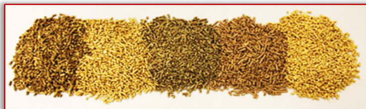
Figure 5. Spectrum of colors of pellets

Some of the raw material may be sawdust, wood chips, lumber mill scrap, and even full trees unsuitable for lumber. The appearance of quality wood pellets is as varied as the many different species of trees. While a spectrum of colors is perfectly natural, wood pellets should generally not be darker than a cup of black coffee. An excessively dark color may indicate that bark was mixed into the manufacturing process, and those pellets will likely have high ash content (Fig. 5).