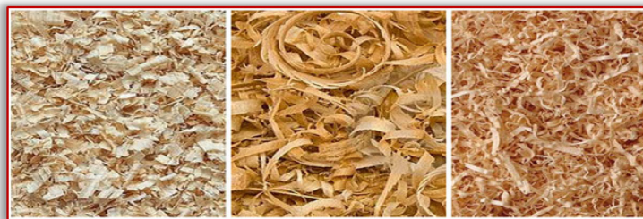
Figure 1. Wood wastes as sawdust

Biomass energy resources are readily available in rural and urban areas. Biomass has been a primary source of energy for many years, used for domestic heating and industrial cogeneration. Biomass-based industries can provide appreciable employment opportunities and promote biomass re-growth through sustainable land management practices. Wood has been the dominant fuel and has a long tradition in Romanian rural areas based on its availability, sustainability, environmentally friendly and renewable natural resource characteristics. Romania has a significant forestry potential of wood and plant to support the production of pellets and briquettes in terms of quality and protection to meet the requirements and standards [16, 17].