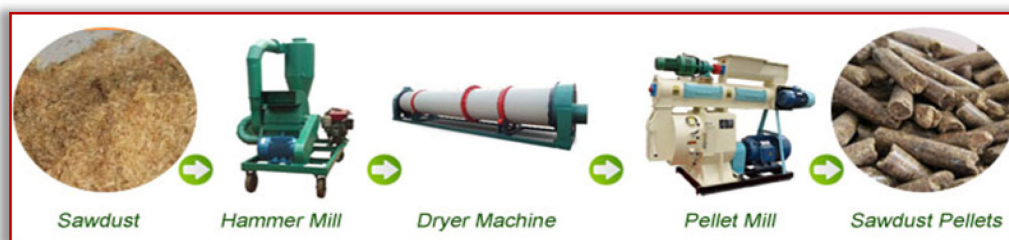
Figure 4. Schematic of pelletization of woody biomass

Raw materials commonly used are sawdust, wood shavings and wood wastes, but also agricultural residues can be used. In cases where there are different types of feedstock, a blending process is used to achieve consistency. If the pellet size is too large or too small, it affects the quality of pellet and in turn increases the energy consumption. Therefore the particles should have proper size and should be consistent. Size reduction is done by grinding using a hammer mill. Before feeding biomass to pellet mills, the biomass should be reduced to small particles (Fig. 4).